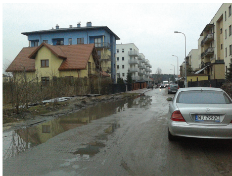
Figure 3. Residential district lacking basic urban infrastructure. Ząbki, agglomeration of Warsaw, Poland.

as PUI provision is concerned, only the designation of roads is a precondition for compulsory land takeover (UGN 2015, 105.4). As far as the financial consequences of the process are concerned, there is a strong imbalance between public and private expenditures. Landowners have to pay a betterment levy of a maximum of 50% of the land value increase related to the land readjustment (UGN 2015, 107.1). On the contrary, the public party has to pay 100% compensation for land acquired for roads (UGN 2015, 106.1), in compliance with existing expropriation regulations (discussed below). Local authorities may recover procedural costs only if the land readjustment was initiated by landowners (UGN 2015, 103.6). Unfavourable economic conditions of land readjustment discourage Polish municipalities to apply this instrument, therefore it is barely used by them (Jędraszko 2005).