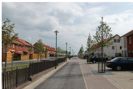
Figure 4. Residential district fully equipped with public urban infrastructure. Seelze Süd, Region Hannover, Germany.

In Germany, there is a general legal requirement for PUI provision before the completion of adjacent buildings (BauGB 2015, 123.2). It means that the presence of infrastructure is one of the conditions to receive a building permit (BauGB 2015, 30, 34, 35). Municipality is obliged to provide infrastructure indicated by binding development plans ( Bebauungsplan – B-Plan) (Fig. 4).