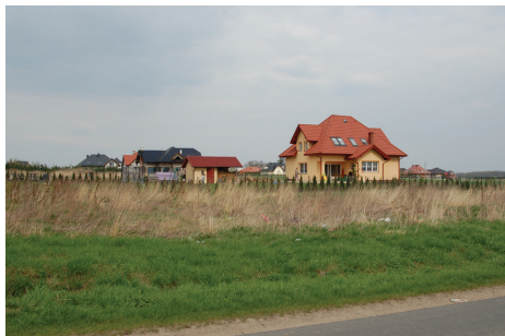
Figure 1. Unplanned growth produces settlement patterns deprived of public urban infrastructure. Outskirts of Wrocław, Poland

which is a part of an ineffective planning and land management system (Jędraszko 2005). Ineffective planning and land management resulted in an over-supply of development land which therefore is impossible to urbanize