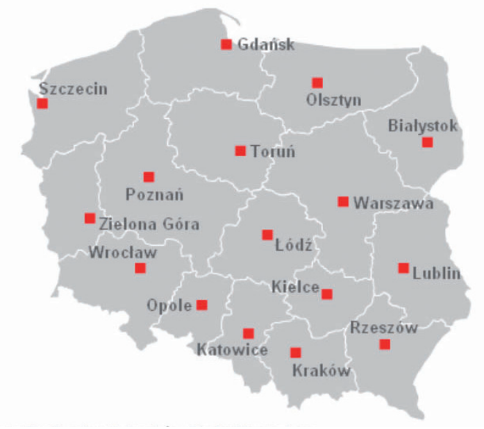
Figure 2. Distribution of regional investor service centres in Poland

The COI Centres (www.paiz.gov.pl) were established in close co-operation with the Regional Marshals who are responsible for the promotion of regions under statutes, and the Centres operate mainly within the Marshal Office's and Regional Development Agencies' structures (Figure 2). The COI personnel operate in accordance with the standards determined by PAIIIZ. The workers were trained by the Agencies and are provided with regular substantive assistance by the Agencies. Each Centre covers one region where it has its office, becoming a source of current data on the regional economy. The Centres also have contact databases with local governments and business-support organizations operating in the region. The main goal of COI operation is to ensure comprehensive investor services on the regional level. The Centres co-operate with PAIIIZ when handling capital-investment projects and provide their investor services independently when the investors contact them directly. The COI's co-operate closely with PAIIIZ by exchange of information (quarterly reports drafted by the Investor Service Centre officers show the Centre's activities in the context of applications made by the potential investors).