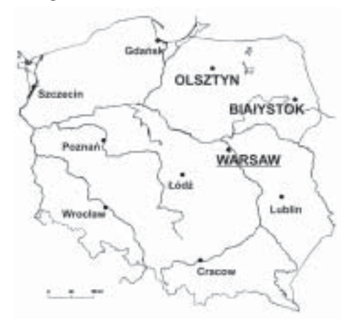
Figure 1. Contour map of Poland.

an apparent temperature calculated for 12 UTC above the 95th annual percentile, and an increase of 2°C compared to the previous day. In the permissible 1–day breaks the apparent temperature may not drop below the 90th percentile.