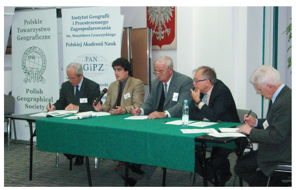
Figure 4. Participants of the Warsaw Regional Forum 2009 taking part in a Discussion Panel Networking in European, regional and local space.