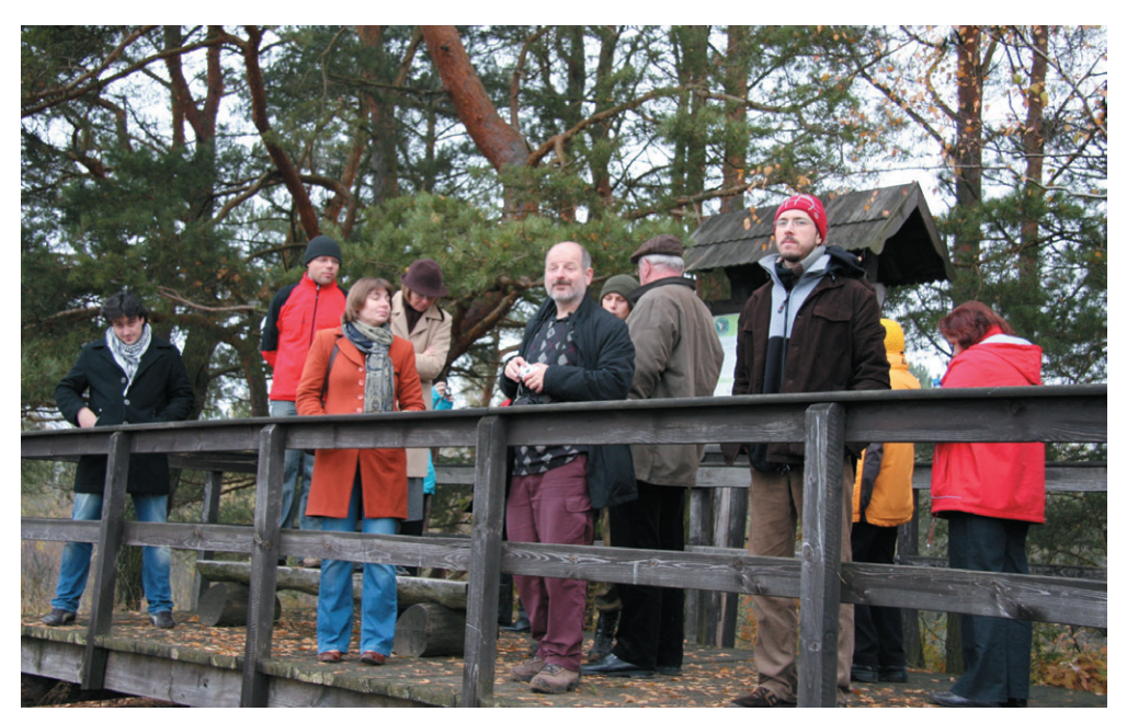
Figure 3. Participants of the Warsaw Regional Forum 2009 during a field studies trip in the Biebrzański National Park.