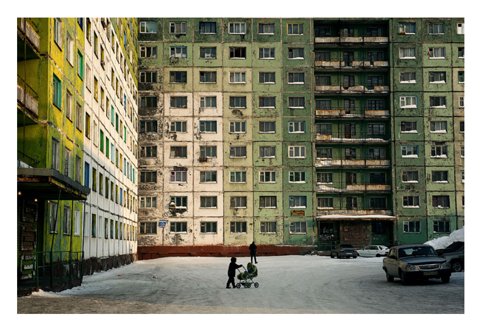
Figure. 2 In the city of Norilsk