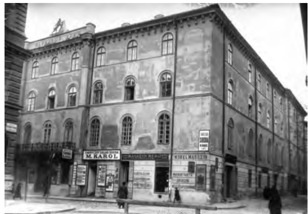
Fig. 4. Community Hall of the Academic Gymnasium.