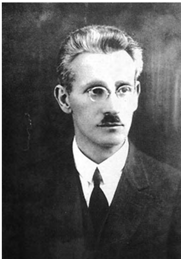
Fig. 9. Ivan Krypiakevych (1886–1967). From the collection of the National Library, Kiev.