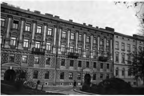
Fig. 6. The Shevchenko Scientific Society.