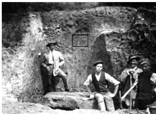
Fig. 11. Excavation at Holyn near Kalush.