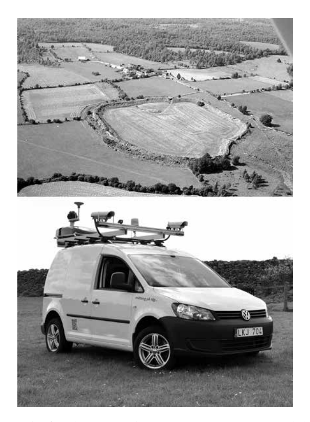
Fig. 1. Aerial photograph of Gråborg (top, photo Jan Norrman 1997, ©Swedish National Heritage Board); the MMS system (bottom: photo Andreas Viberg 2014)

risk, the importance of documenting the masonry structures becomes all the more urgent. Until now traditional archaeological documentation methods, such as photography and field drawing have been used at Gråborg. These methods have produced important results, but they are time consuming and the complete documentation of the entire ring-fort would be a lengthy and tedious process. Therefore, the use of 3D digital documentation methods, such as terrestrial laser scanning or photogrammetry, presents an interesting alternative (see Vosselman and Maas 2010).