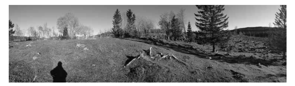
Fig. 2. Panorama of the Tromsdalen site, view to the southeast

a series of pits of unknown purpose, giving them a characteristic layout reflected in their name. It was therefore decided to survey several iron production sites by recording the topsoil MS and performing detailed fluxgate gradiometer surveys. Special attention was paid to the possibilities of locating, delimiting and characterizing such sites, which have the potential to contribute importantly to knowledge of the spatial organization of prehistoric iron production in the region. The sites were surveyed with a Bartington MS2-D field loop and a handheld Bartington Grad 601-dual fluxgate gradiometer surveys were conducted with a traverse interval of 0.5 m and an inline sampling interval of 0.125 m. At Budalen, 640 topsoil MS readings were recorded with a RTK GPS over an area of 7567 m<sup>2</sup>, an average of 3.4 m between readings. At Tromsdalen, 431 topsoil MS readings were taken over an area of 3865 m<sup>2</sup>, an average of 3 m between readings. The susceptibility datasets were interpolated to raster surfaces by ordinary kriging, ensuring both