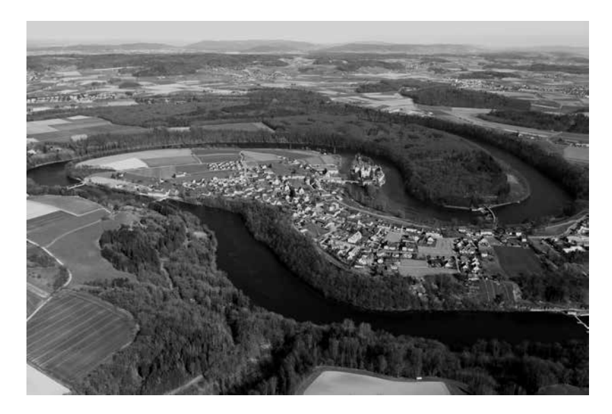
Fig. 1. Aerial view of the research area at Rheinau (Switzerland) / Jestetten (Germany) with the two peninsulas.