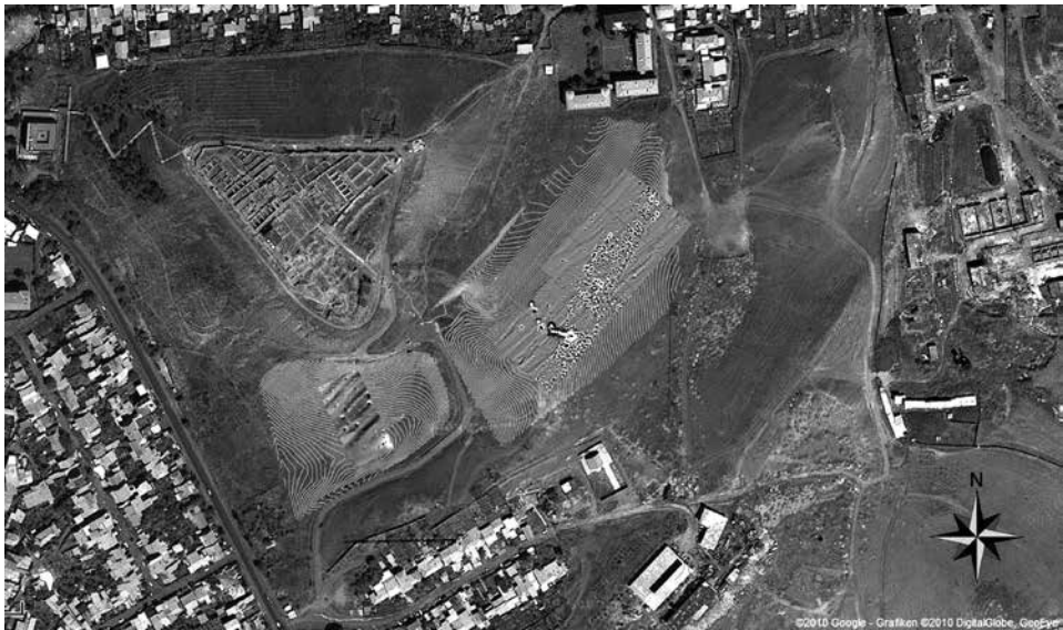
Fig. 1. Georeferenced satellite image (Google Earth) of Erebuni fortress, overlaid with the contour map and the magnetic map (grid size 40 m x 40 m, technical data see Fig. 3, north is at the top)

the beginning of the 7th century BC and thus to the late phase of Urartian hegemony (Stone and Zimansky 2009). In a building inscription from Ayanis, Rusa II reported that he had a fortress and a settlement built there (Salvini 2008). The settlement structures in the southern part of the fortress appear to have been professionally planned and erected. Some of the buildings are exceptionally big, which suggests that they might have been public assembly rooms (Stone and Zimansky 2001).