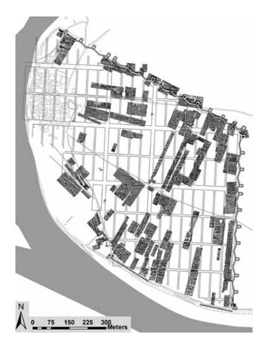
Fig. 3. Example of orthogonal city planning: magnetic map on the site of Apamea on the Euphrates (Turkey) (scale white/black -10/+10 nT/m)

about the spatial organization of the ancient cities. In the Near East, this has touched on two periods representing significant phases of urbanisation of the region: firstly, the Early Bronze Age with the development of circular cities in Northern Syria and at the limits of the arid margins to the west, known as the second urban revolution of the region (Akkermans et al. 2002), and secondly, the Hellenistic period after Alexander's conquest, with the diffusion of an orthogonal city-planning model inspired by the Hippodamian plan, which had appeared in Asia Minor in the 5th century BC (Martin 1974). Impressive results have been obtained on numerous sites like Tell Chuera (Meyer 2010), Tell al-Rawda (Gondet and Castel2004) for the Early Bronze Age or Apamea (Gaborit et al. 1999), Dura-Europos (Benech 2007), Cyrrhus (Abdul Massih et al. 2009), Palmyra (Becker and Fassbinder 2001) concerning the Hellenistic foundations. These geophysical maps have undoubtedly changed the perception of these cities and have helped to contextualise the old excavations in the overall spatial organisation of the urban layout. They have also changed archaeological excavation strategies to locate more precisely forthcoming digging projects designed to confirm and understand what the geophysical maps have revealed.