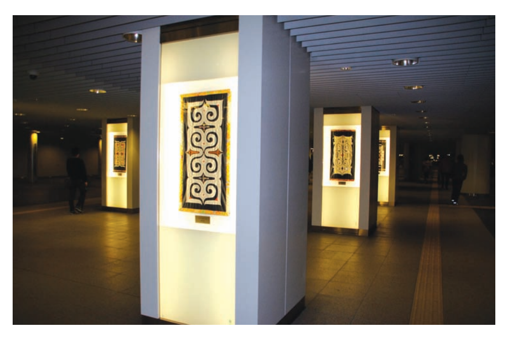
Ajnuan motifs in an underground passage in Sapporo. Photo: L. Buchalik 2015.