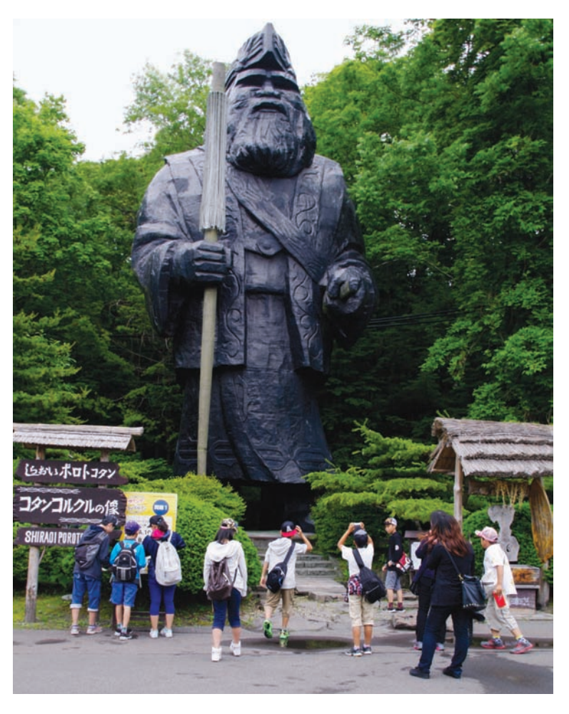
The Shiraoi Museum.

Lucjan Buchalik Muzeum Miejskie w Żorach ul. Muzealna 1/2, 44-240 Żory, POLAND e-mail: lucjanbuchalik@muzeum.zory.pl