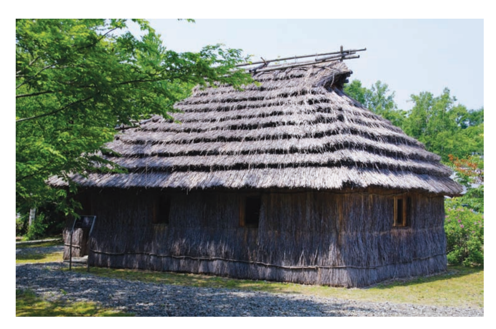
Traditional Ajnuan farm at the Biratori-Nibutani Museum.