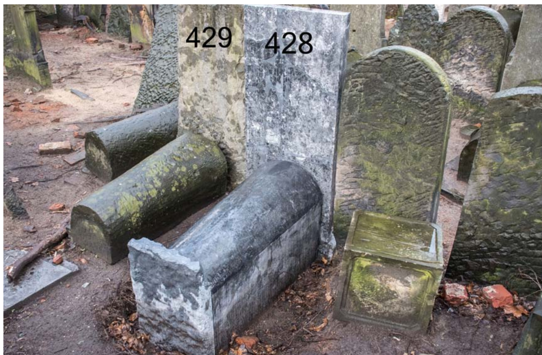
Fig. 2. Warsaw, Wola necropolis. A stone box type tombstone.

as a vertical stone or cast-iron slab, dug into the ground on the eastern side of a grave pit. 13 The tombstones in the Wola cemetery have various forms of crowning (or coping), which take the shape of an arch or a rectangle, rarely of a triangle. In the upper part of the stele, there is a relief decoration, sometimes with an inscription consisting of two Hebrew letters ‘pe’ and ‘nun’, meaning an abbreviation of the Hebrew expression ‘here rests’. A part of the stele is occupied by the proper ledger with an inscription field, usually in Hebrew (on progressive/assimilationists’ monuments also in Polish, German, and even Russian). The inscription letters are mostly written in concave relief. The less frequent convex letters are characteristic of the older style of matzevah decoration, occurring until the mid-19 th century. The inscription field is bounded on both sides by semi-columns, pilasters, or a decorative border. The lowest part of the matzevah, a plinth visible above ground level, usually features a motif of a brick wall with a two-door gate, geometric, floral, and zoomorphic designs, including fantastic beasts, and sometimes an inscription. In the 19 th century, monuments made of cast iron started to appear on Okopowa Street.