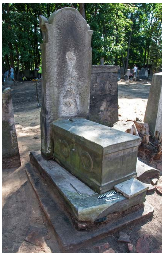
Fig. 1. Warsaw, Wola necropolis. Two types of gravestones: grave no. 429 – a stele with a type one monolithic block, grave no. 428 – an intermediate form between the monolithic type and stone box type. Grave no. 428 – state after conservation.

The eastern and central parts of the studied area have survived almost intact, with the only damage being the bullet marks visible on the monuments. In the north-western part of the surveyed area, a deep hole was dug for a mass grave during World War II, destroying the 19 th century burials located there. Today, there are no matzevot or other stone memorial elements in the area of the mass grave and the adjacent area to the south. The southern part of the surveyed area has, apart from a few exceptions, retained the original layout of the gravestones.