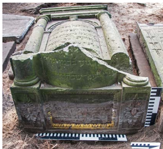
Fig. 9. Warsaw, Wola necropolis. Grave no. 685 – fragments of yellow polychrome on the plinth.