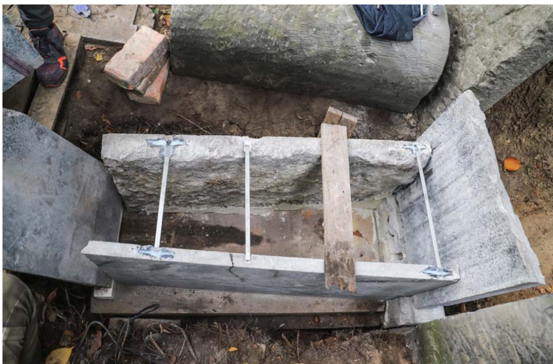
Fig. 4. Warsaw, Wola necropolis. Grave No. 428 – conservation work, visible sandstone foundation supporting stone kerbs on which a half-cylinder slab will be placed.

ceiling lined with bricks. In no case was the use of planks for shoring the burial chamber observed at this level as attested in many Jewish cemeteries, e.g. in Węgrów, Wyszogród, Maków Mazowiecki, Krasiczyn, and Warsaw's Bródno district. 25