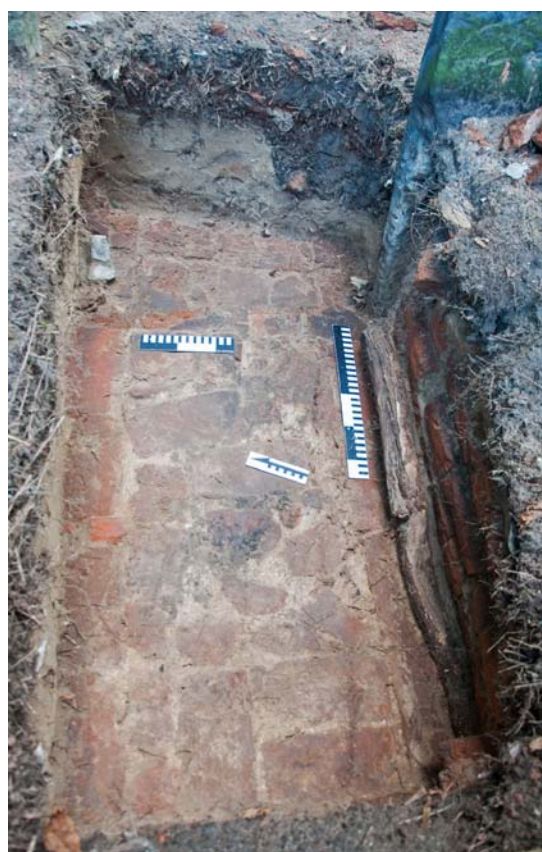
Fig. 5. Warsaw, Wola necropolis. The 'floor' of grave no. 428.

From the outset, the investigations on plot 1 demonstrated the scale of the destruction, so a rescue programme was developed for the oldest and most damaged or endangered tombstones. 26 A thorough restoration and conservation of the selected monuments sometimes requires intervention in the soil. In such cases, damaged monuments are excavated and the area is cleared and reinforced for the resetting of the restored tombstones. By participating in conservation work, we have the only opportunity to look deeper without disturbing human remains.