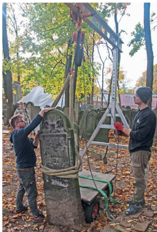
Fig. 13. Warsaw, Wola necropolis. Grave no. 20 – the removal of a matzevah.

of the gravestone. 30 In this case, however, the door was intentionally buried below the surface of the ground, as appears to be evidenced by the unfinished sides of the matzevah up to the height of the rustication on the pedestal, and by irregular streaks and splashes of paint on the undressed lower section of the plinth and the lower section of the back