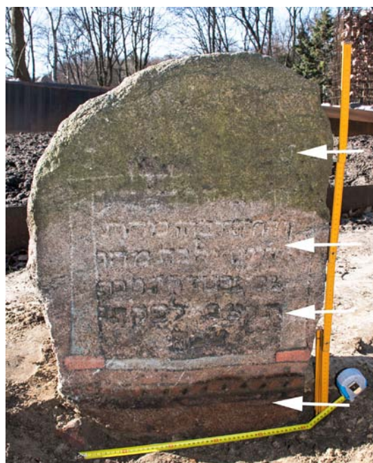
Fig. 18. Warsaw, Wola necropolis. Grave no. 846.