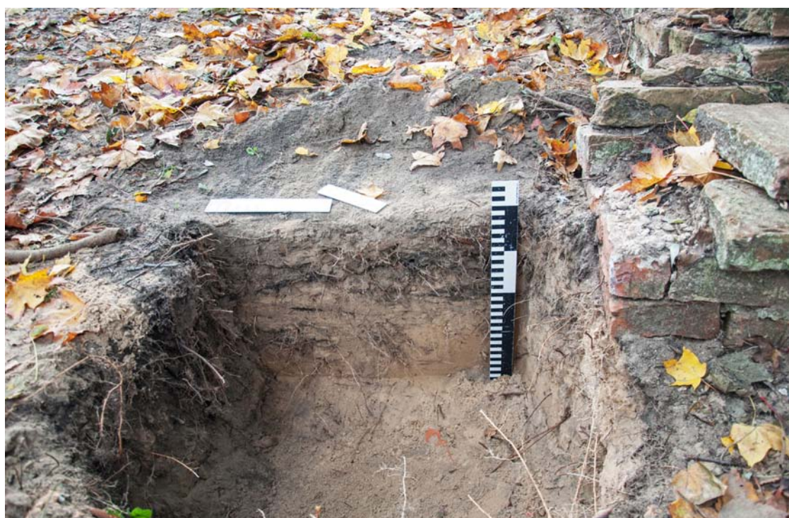
Fig. 14. Warsaw, Wola necropolis. Grave no. 20 – eastern profile of the chamber.

of the gravestone. 30 In this case, however, the door was intentionally buried below the surface of the ground, as appears to be evidenced by the unfinished sides of the matzevah up to the height of the rustication on the pedestal, and by irregular streaks and splashes of paint on the undressed lower section of the plinth and the lower section of the back