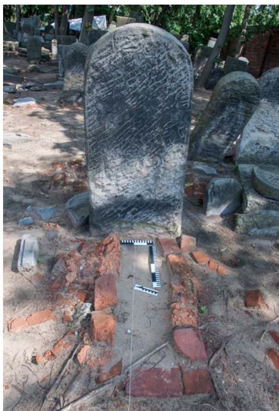
Fig. 3. Warsaw, Wola necropolis.

In plot 1, there are also non-traditional tombstones, which have small architectural and sculptural forms: an obelisk, a near-perpendicular tombstone, a free-standing column, often a broken, full-body sculpture in the shape of a broken trunk or felled tree, and a vase or urn standing on a pedestal or column. 17