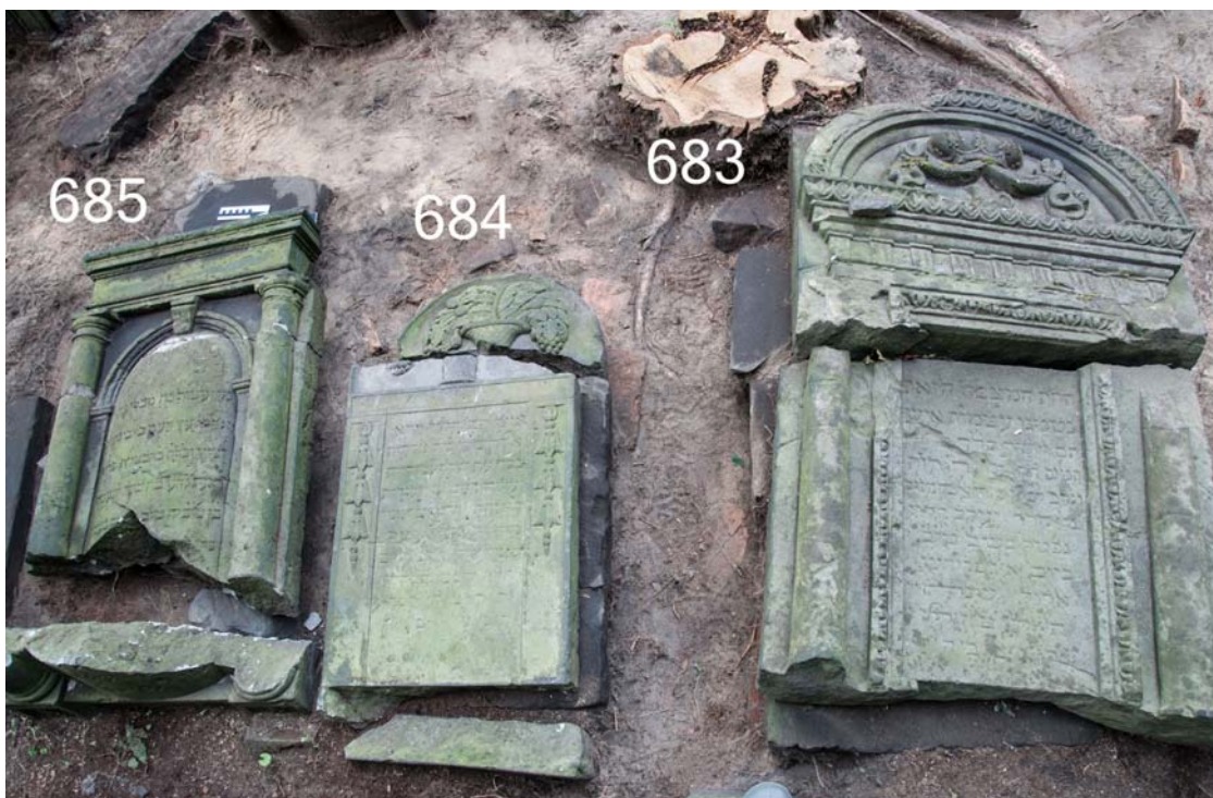
Fig. 8. Warsaw, Wola necropolis. Graves 683, 684, and 685 – the state before the start of the investigations.