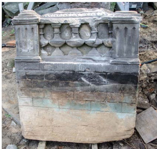
Fig. 11. Warsaw, Wola necropolis. Plinth of grave no. 683.

in green and black (Fig. 11). After cleaning the resulting section of the burial chambers, we obtained information about their construction. Grave no. 685 has three layers of bricks covering the entire (?) space of the chamber, with another stone slab placed on top of an approximately 5 cm layer of sand. The neighbouring grave no. 684 has a slightly different structure: four layers of bricks along the outline, with their headers facing the matzevah, and in the free space, inside the chamber, there is brick and stone rubble. A stone slab was placed directly on top of the bricks. Grave no. 683 had only two layers of bricks along the outline, overlaid by a fragment of a stone slab (removed in preparation for the dismantling of the matzevah). Below the brick foundations was yellow sand without visible pits or cuts (Fig. 12). An analogous situation was observed in other parts of the cemetery.