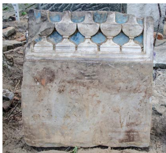
Fig. 10. Warsaw, Wola necropolis. Grave no. 685 – polychromed lower part of the plinth.

in the form of rectangular pedestals for the bases of Doric columns. The lower part of the plinth in the form of a brick wall has preserved polychrome