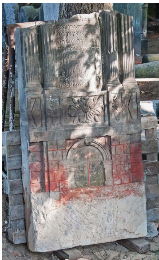
Fig. 17. Warsaw, Wola necropolis. Grave no. 289 – the matzevah after its removal from the ground.

No potential conflict of interest was reported by the author.