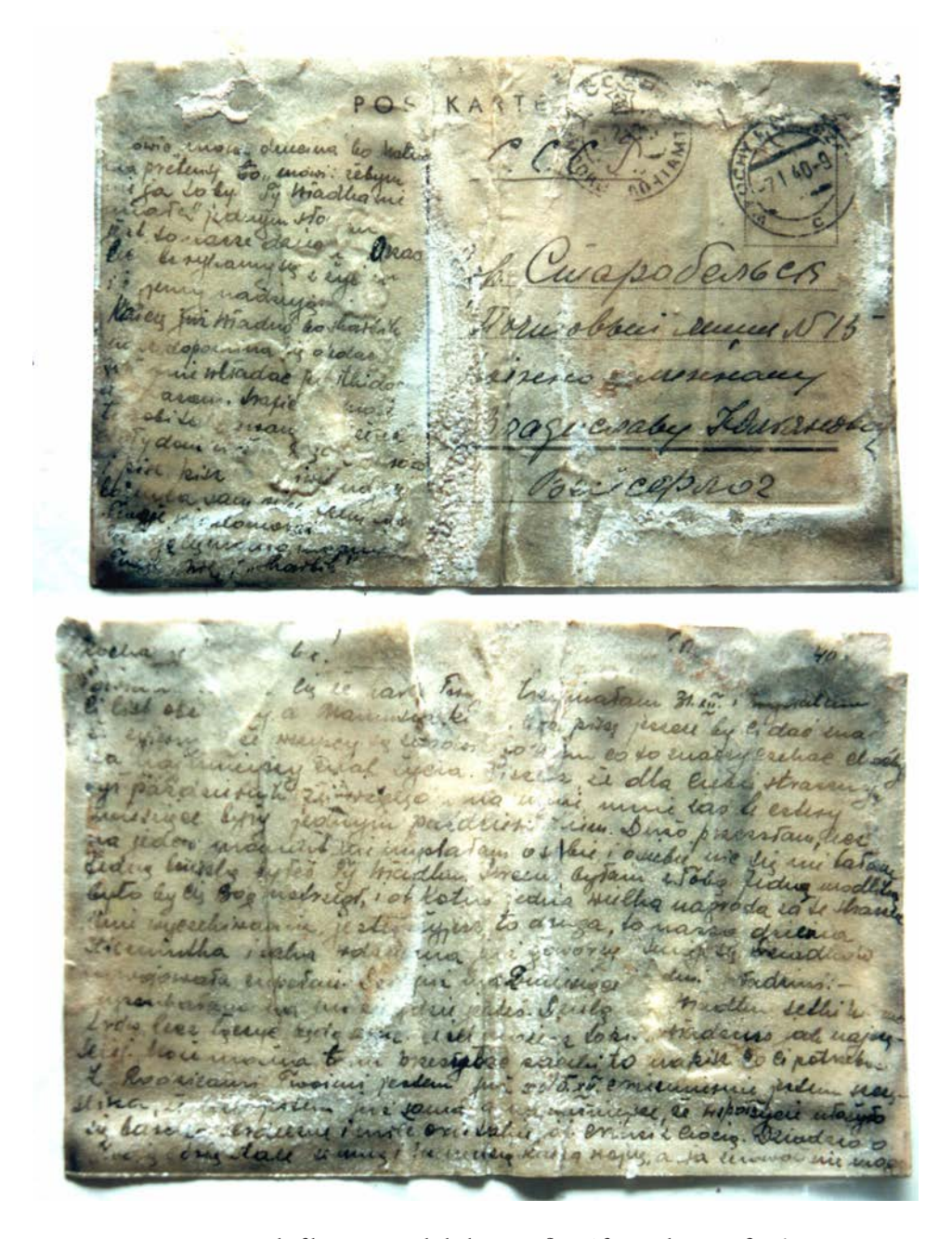
Fig. 7. Postcard of lieutenant Władysław Wejsflog. After: Kola 2005: fig. 62.