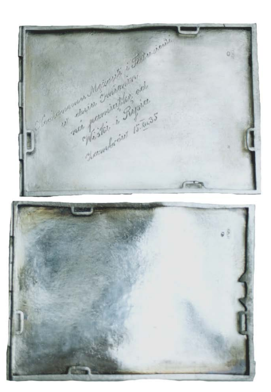
Fig. 2. Silver cigarette case with engraved inscription: TO OUR BELOVED HUSBAND AND DAD ON HIS NAMEDAY FROM WIŚKA AND RYSIO, ZAMBRÓW 15.XII.1935. After: Kola 2005: fig. 134.