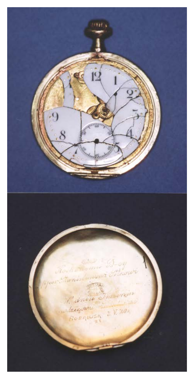
\textbf{Fig. 5.} \ \textbf{A} \ \textbf{golden} \ \textbf{pocket} \ \textbf{watch} \ \textbf{with} \ \textbf{engraved} \ \textbf{inscription:} \ \textbf{TO} \ \textbf{OUR} \ \textbf{DEAR} COMMANDER LIEUTENANT STANISŁAW SITEK ON HIS NAMEDAY GRATEFUL .... BORUJSK 8.V.20. After: Kola 2005: figs 81, 224.