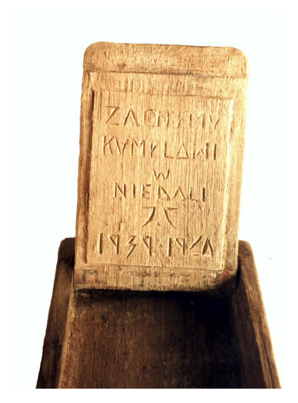
Fig. 1. Cigarette case with an inscription inside the cover: TO A NOBLE MATE IN MISERY JC. 1939–1940. After: Kola 2005: fig. 81.