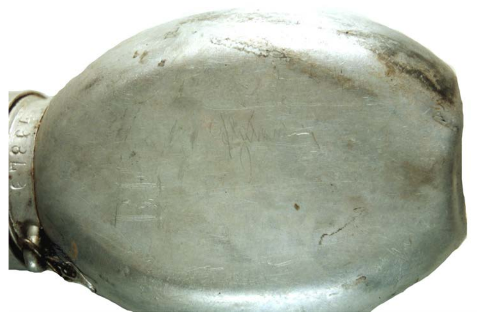
Fig. 3. Aluminium flask with scratched inscription: J. GIBASIEWICZ BF. After: Kola 2005: fig. 76.