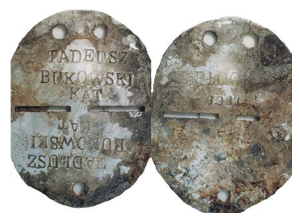
Fig. 6. Dog tag - obverse: Tadeusz Bukowski KAT., reverse: PŁOCK 1911. After: Kola 2005: fig. 37.

However, there were also objects univocally identifying the victims – these were military dog tags (Fig. 6). These small aluminium oval discs with transverse cuts contained personal data – name, surname, religion on one side and on the other – identification number/first letter of district, name of local command and the date of birth. Some inscriptions were difficult to decipher due to the material which was deposited on them by decomposing bodies, or they were damaged, covered with corrosion and impurities. The cemetery in Kharkiv delivered a total of 62 dog tags: 10 items in 1991, 10 in 1995, and 42 in 1996 (Kola 1998: 36).