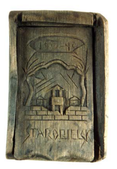
Fig. 4. Wooden cigarette cases with inscriptions: STAROBIELSK 193 –1949. After: Kola 2005: fig. 78.