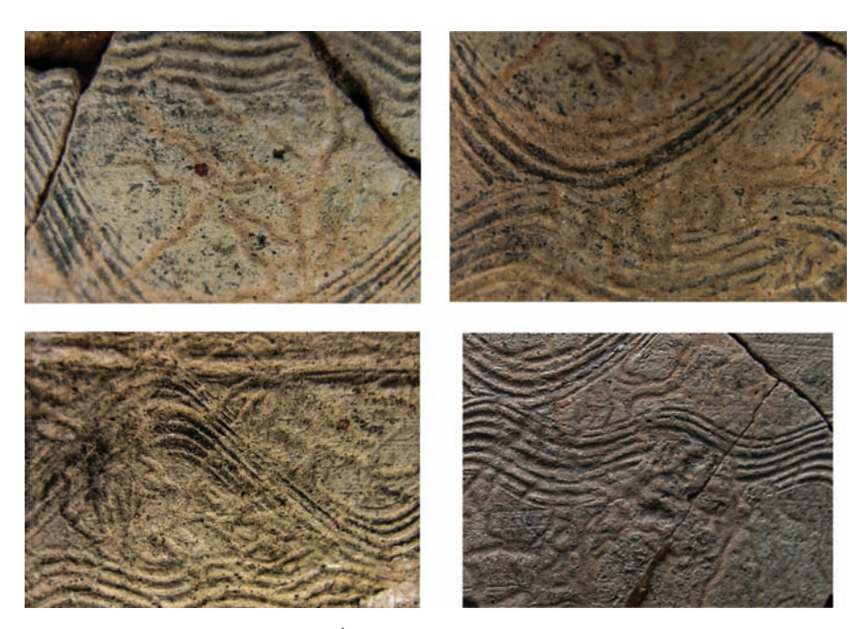
Fig. 3. Szczaworyż, Busko County, Świętokrzyskie Voivodeship. Damage to surfaces of pottery

is a constant component in the set of vessels in use at this site. Features comprising low (and high) percentage of pottery with calcium carbonate are dated to phase II and phase III of Stradów pottery. Phase II is dated from the second half of the 9<sup>th</sup> up to the middle of the 10<sup>th</sup> century (Szmoniewski and Tyniec 2010, 13), and Phase III – about the middle of the 10<sup>th</sup> up to the middle of the 11<sup>th</sup> century (Maj and Zoll-Adamikowa 1992; Tyniec-Kępińska 1996; 2007, 103-105).