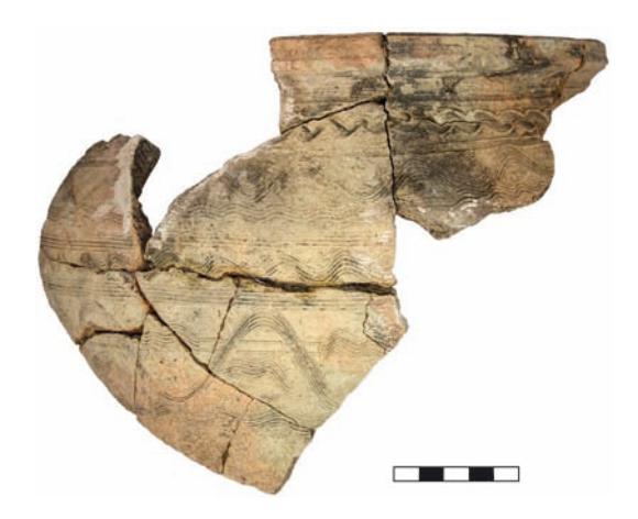
Fig. 2. Szczaworyż Busko County, Świętokrzyskie Voivodeship. The diversified colour of vessels surfaces

great strongholds of the tribal period or the practice of building huge barrow-graves, the specific recipe for this type of ceramic fabric for vessels, remains one of the distinguishing features of the material culture of early medieval western Lesser Poland (Radwański and Tyniec 2010). Use of clays with admixture of calcium carbonate resulted mainly from accessibility of raw material deposits. Despite the fact that this raw material caused numerous technological problems (for example this fabric required taking extra care during firing clay pots), such type of pottery in a short time became dominant (at sites in the area of contemporary Kraków) or constituted a very significant percentage share among pottery production of pre-craft character (for example in Kraków Nowa Huta-Mogiła, Kraków Kurdwanów or in hillforts in Stradów or Szczaworyż).