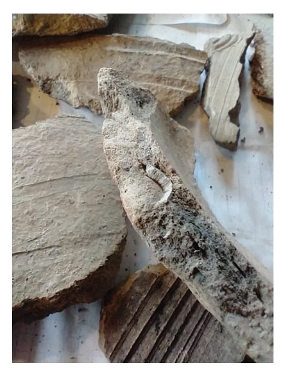
Fig. 4. Proszowice, Proszowice County, Lesser Poland Voivodeship. Pottery with admixture of crushed Inoceramus shells

It is still an open question whether the admixture of crushed Inoceramus shells is the potential source of calcium carbonate in "white" pottery as it was suggested in a footnote (op. cit., footnote 12). The lack of published information on observations of such remains in assemblages of "white" pottery deriving from other regions and their presence in the ceramic fabric at two sites from the Nida Basin (Stradów and Szczaworyż) may testify the local character of this phenomenon. It turns out that crushed Inoceramus shells in ceramic fabric are also present in pottery from Kraków (for example inventory reports on