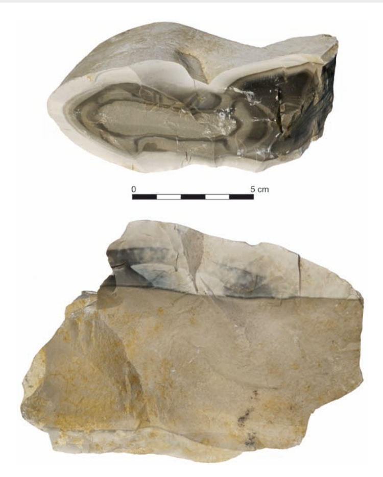
Fig. 4. Borownia. Two varieties of flint from the mine. The first variant (on the bottom of picture) was flint with no banded core and with a thick grey layer below the cortex – the first sickle preform was produced from this kind of raw material. The second variant (upper part of the picture) has a lot of grey bands that are difficult to knap – the second sickle was produced from this kind of material. Illustrated by A. Pałasz

When we look at both half-products, we can easily see that the first sickle is made entirely of a subcortical, light-beige layer surrounding the concretion. On the other hand, the second – from the subcortex and dark banded parts, intensively reduced on one of the surfaces so that only the part from the more cleavable subcortex was subjected to further processing. The reduction of bifacial tools from less cleavable raw material is quite obvious. Working in this way, the craftsman wanted to deal with the raw material that could be processed as best as possible. There was no such need in the workshops in Ożarów, known to us, where bifacial sickles were made – there was a homogeneous flint of good quality (Grużdź 2020).