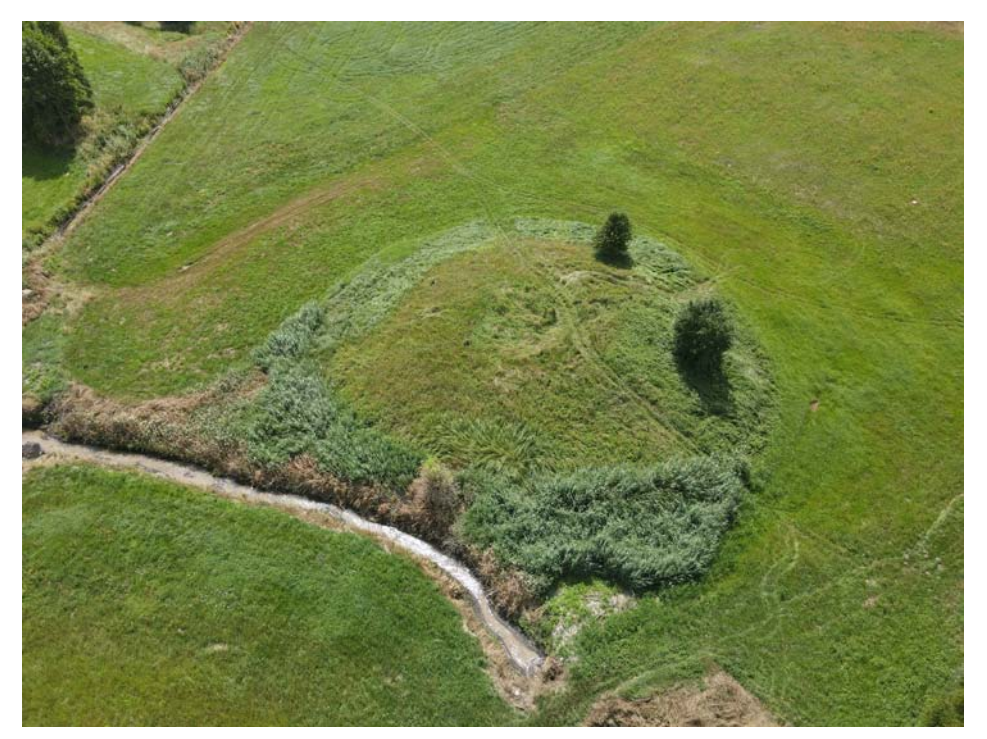
Fig. 3. View of the mound in Mierzyn from the north, 2021.