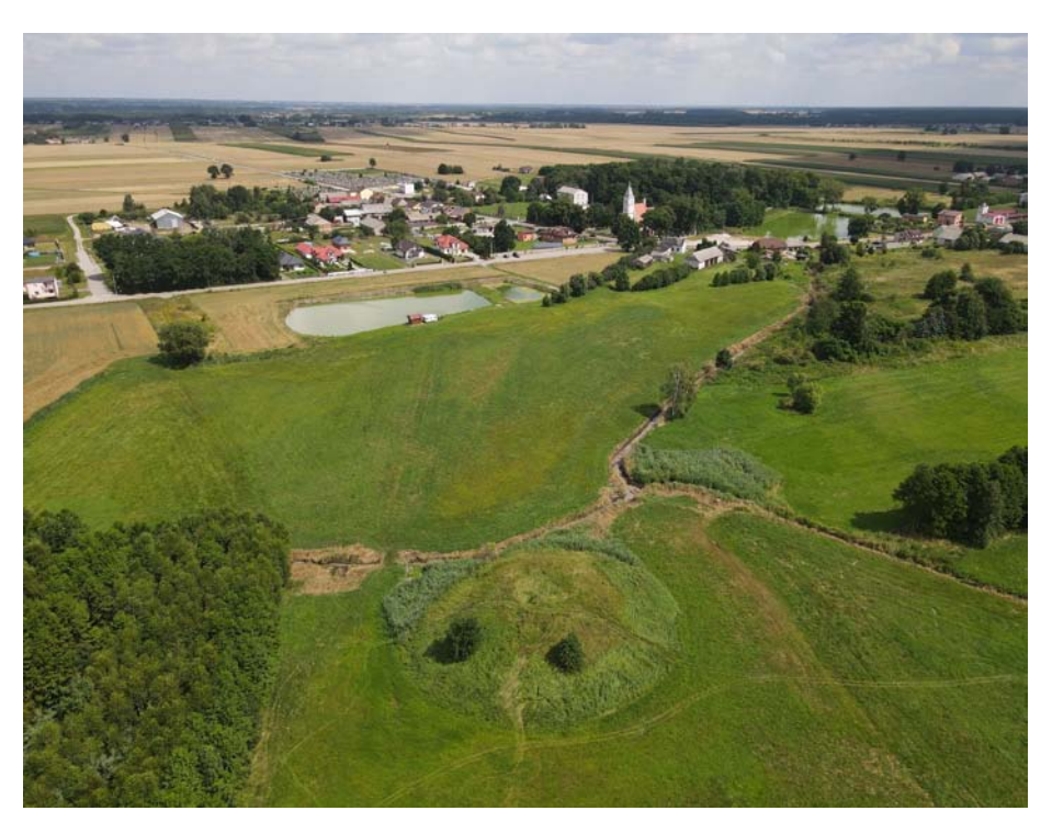
Fig. 1. Aerial view of the Mierzyn stronghold and its surroundings, 2021.