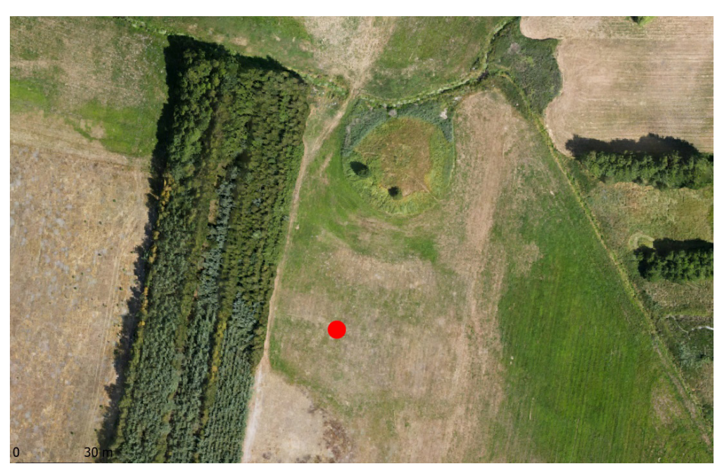
Fig. 6. View of the stronghold at Mierzyn and its economic hinterland marking where the bull was found - red point, 2022.

The tombstone of Mikołaj from Cieszanowice from the first half of the 16<sup>th</sup> century<sup>10</sup> (Fig. 2) is still preserved in the church, and its heavily worn surface proves that it was originally embedded in the church floor. Thus, it is very likely that the knight's seat at Mierzyn co-existed with the church in the 15<sup>th</sup> century.