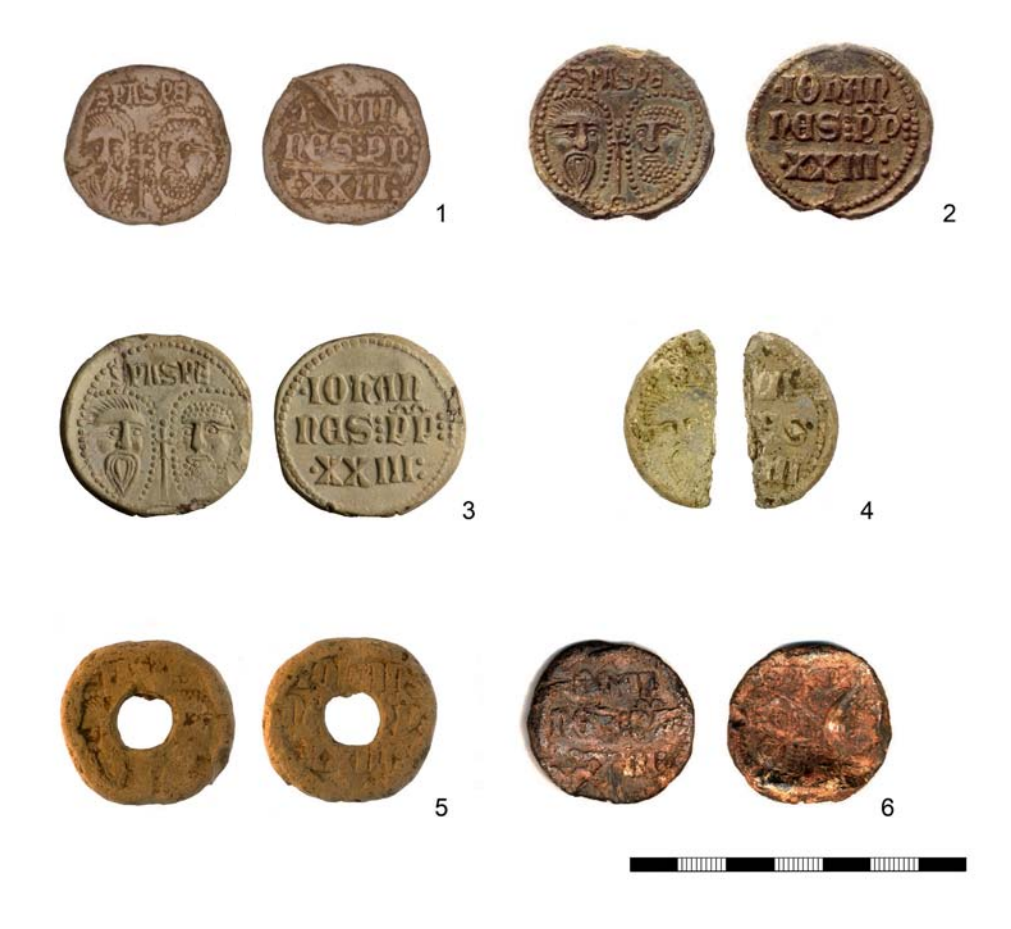
Fig. 10. Finds of bulls of antipope John XXIII from England: 1 – Babergh District (SF-24E3BA); 2 – Epsom and Ewell District (SUR – 91AB24); 3 – Wiltshire District (WILT-5D31FF); 4 – West Lindsey District (NCL-47CBF6); 5 – Richmondshire District (SWYOR-F52016); 6 – Mid Suffolk District (SF6390).

Ostrów Tumski in the vicinity of the cathedral.<sup>38</sup> Single relics were uncovered by archaeological research in the Old Town in Gdańsk,<sup>39</sup> on the grounds of the Cistercian monastery in Kołbacz,<sup>40</sup> in the Teutonic Knights' castle in Człuchów,<sup>41</sup> and on the grounds of the castle in Grodno in Lower Silesia.<sup>42</sup> However, only three years later, Borys Paszkiewicz, discussing a bull discovered at the 'Plac Nowy Targ' site in Wrocław, listed a total of more than twenty such objects. In doing so, he indicated that these seals may not have been properly recognised previously.<sup>43</sup> The increase in the number of finds is also linked to the use of metal detectors