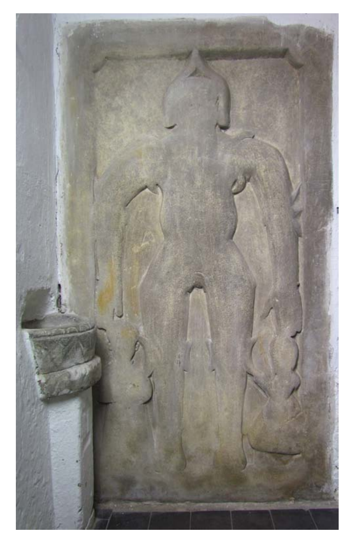
Fig. 2. Tombstone of Mikołaj of Cieszanowice from the first half of the 16<sup>th</sup> century.

coat of arms (also known as Jarosław of Wardzyń), known in sources from 1388, who sometimes between 1390 and 1394 became a pantler ( dapifer ) of Sieradz, and in the years 1394-1400 was a cup-bearer ( pincerna ) of Sieradz. His successor in this position, Piotr of Widawa, is mentioned from 4 April 1402.<sup>4</sup> Later information on property divisions in the village comes from 1447 and 1452, in documents that attest to the functioning of a 'fortalicium' in Mierzyn at that time.<sup>5</sup> Therefore, the only personal clue in the case of the bull of John XXIII found in Mierzyn, for chronological reasons, concerns the son of the owner of this estate, i.e., Tomasz, the Sieradz master of the hunt ( venator ) in 1411-1452, who may have taken over this position from Zbigniew Bąk of Bąkowa Góra, of the Zadora coat of arms, as early as 1410.<sup>6</sup>