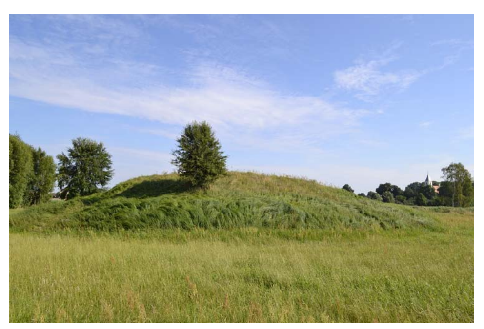
Fig. 4. View of the mound in Mierzyn from the north-west, 2022.

A prominent landmark in the topography of Mierzyn village is the brick church of St. Nicholas and the Blessed Virgin Mary, first mentioned in sources in 1435. Only the chancel of the church was built in the Middle Ages, of which the original cross-ribbed vaults with keystones bearing the coat of arms of Jelita have survived to this day. This church was the centre of a parish which was established before 1399. The parson Mathias of Mierzyn is mentioned