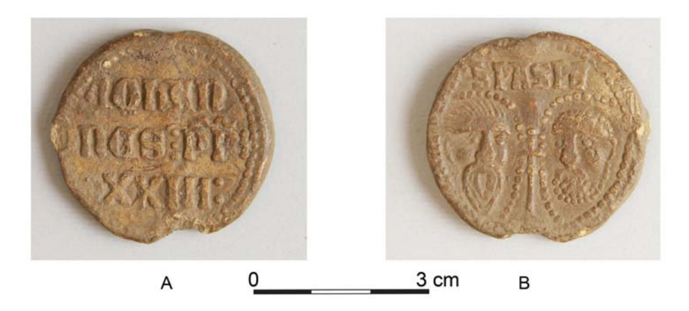
Fig. 7. Bull of Antipope John XXIII: A - Reverse, B - Obverse.