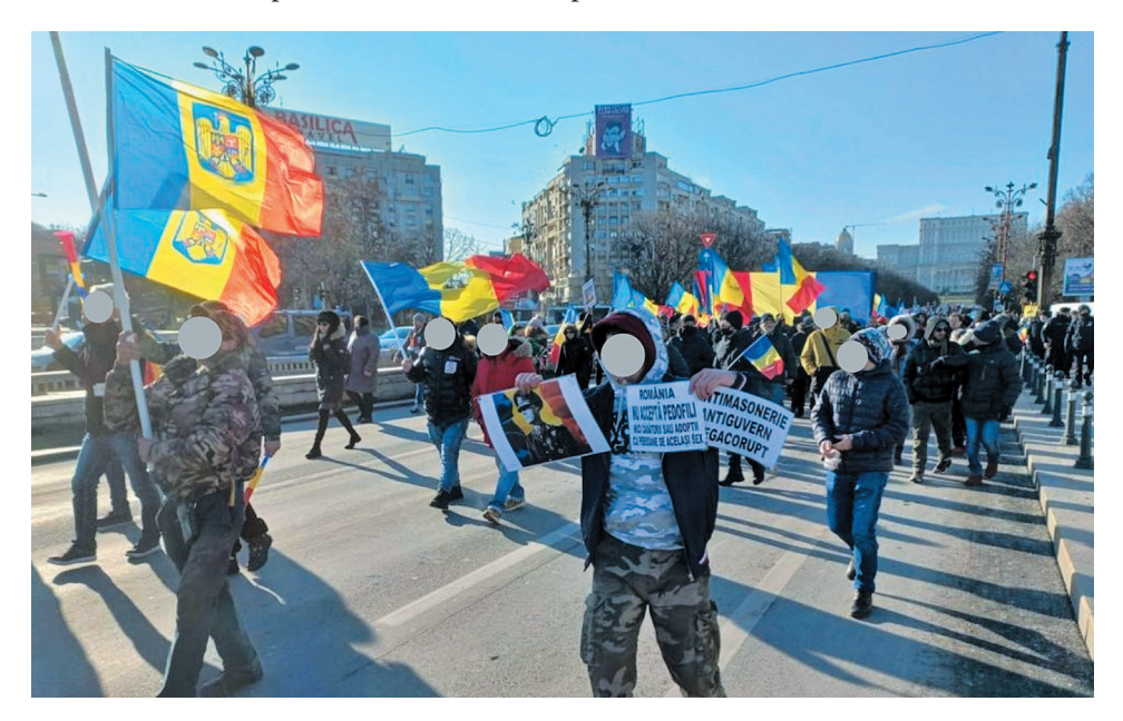
Picture 3. The march of AUR's supporters in December 2021. The supporters display the image of the second World War Marshall Ion Antonescu (a contested figure in Romania) alongside messages against paedophilia, masonry, corrupt government, and same sex marriages.

On 21<sup>st</sup> December 2021, 1,500 supporters of AUR and other far-right groups marched across Calea Victoriei and stormed the gates of the parliament building, vandalising several cars belonging to foreign embassies. AUR sympathizers first jumped over parliament's perimeter wall and then pushed the security personnel protecting the building inside. During this violent rally, the redesigned flag and pro-freedom slogan were observed as the most striking visual symbols of the ceremonial revolution. AUR's storming of the parliament seems to parallel the modus operandi of the January 6<sup>th</sup> Insurrection in the USA. In early 2022, AUR tried unsuccessfully, to replicate the Canadian truckers protests and block transportation in Bucharest.