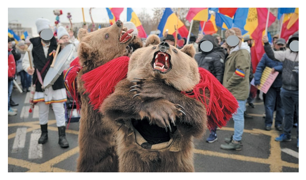
Picture 2. Traditional bear costume brought by AUR's supporters from the northern Romania at the October rallies.

Picture 1. Iconography used by AUR's supporters at the October and November rallies. The icon represents Virgin Mary and baby Jesus, a beloved and sacred image in the Romanian consciousness.The second is a ribbon whose contours showcase the Romanian flag. It was handed by AUR and the NGO "Action for the Nation" to the people participating at the rallies.