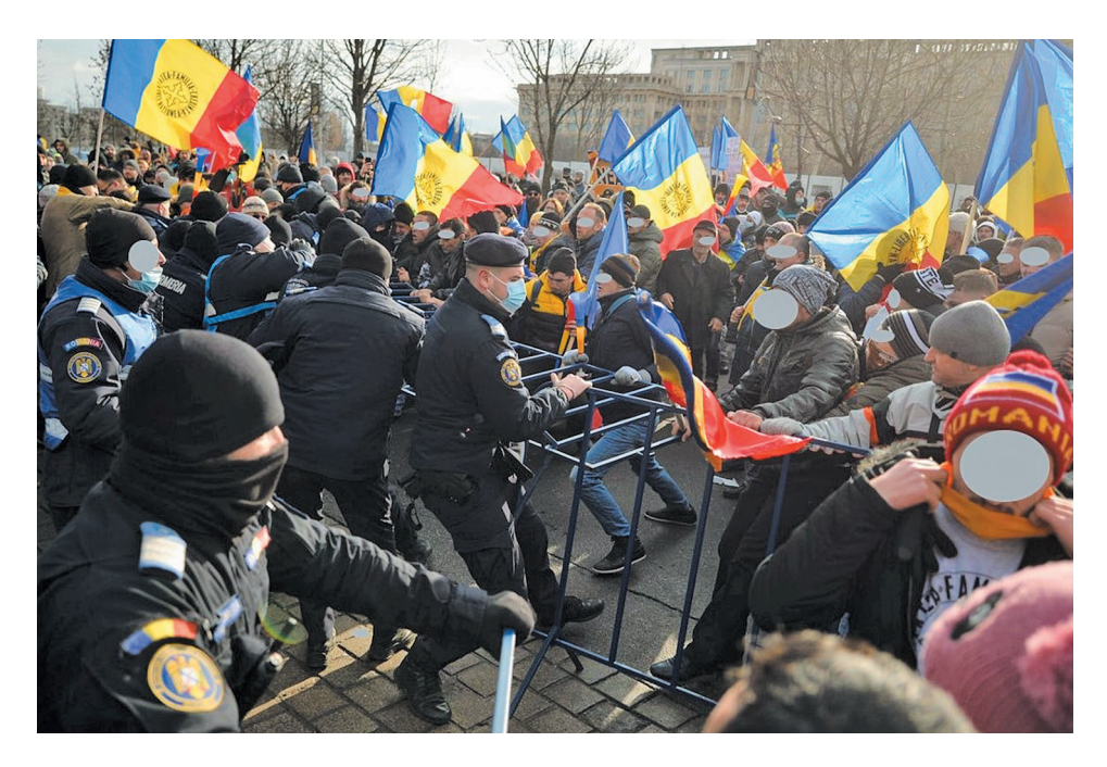
Picture 4. AUR's supporters are storming the gate of the parliament and fight the gendarmes assigned to protect the institution.

Many of these events bear a striking similarity. In all of them, people attempt to challenge the rules of the democratic process, with which they disagree. Further analysis has revealed that most ultra-conservative groups which supported AUR in 2021 joined the storming of parliament. The Orthodox Brotherhood and the New Right members were the most prominent among them. The call for action was justified by fears that the proceedings from parliament would affect people's freedom and deprive them of their constitutional rights; therefore, it was their duty to stop the vote. As argued by Mudde (2019), in its conceptualization of far-right ideology, AUR's sympathizers confirmed the party's strong ideological shift to the fringes of the right. They engaged in violence against government institutions to draw the media's attention to their ideas.