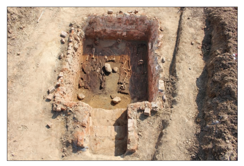
Fig. 3. Rękawczyn, Orchowo Municipality, Greater Poland Province. Trench 3. Crypt. Horizontal view of the graves