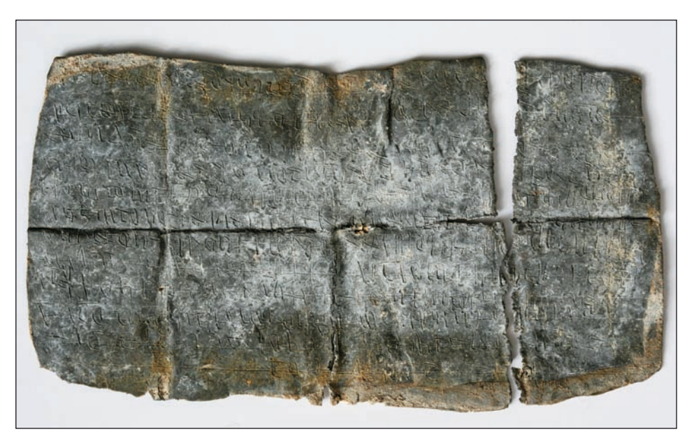
Fig. 6. Rękawczyn, Orchowo Municipality, Greater Poland Province. Christian textual amulet on lead sheet, side B, inner side