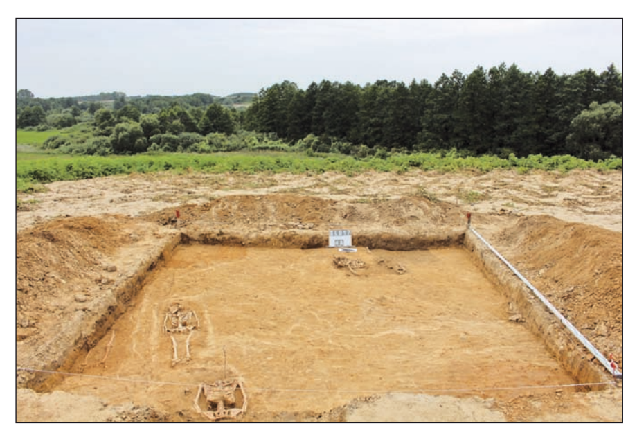
Fig. 4. Rekawczyn, Orchowo Municipality, Greater Poland Province. Trench 4. Cementery. Horizontal view of the graves