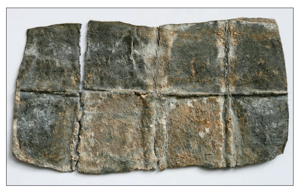
Fig. 5. Rękawczyn, Orchowo Municipality, Greater Poland Province. Christian textual amulet on a lead sheet, side A, outer side