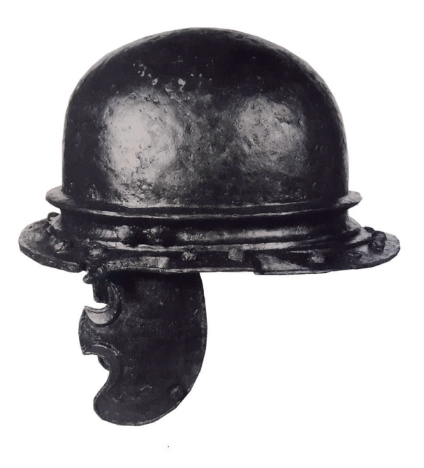
Fig. 5. Gladiator helmet from Museo dei Gladiatori, 50-75 AD. After La Regina 2001, 373.