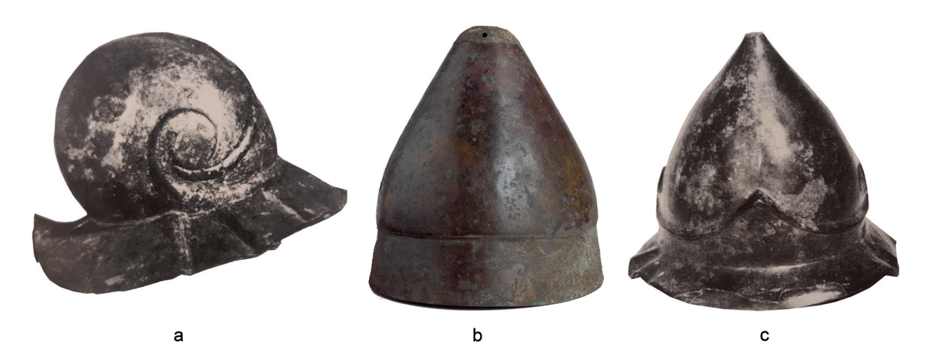
Fig. 4. a – late-Boeotian helmet from the Museum of Art and Design Hamburg. After Waurick 1988, Fig. 24; b – Pilos helmet sold in Hermann Historica in 2005. After Hermann Historica. 49. Auktion, lot. 163; c – Attic-Boeotian helmet ( konos ) from the Ashmolean Museum in Oxford. After Waurick 1988, Fig. 14.

ans. Most finds come from Thrace (at least four) and the northern Black Sea coast (about ten). Iconographic sources come from Macedonia, Samos, and Asia Minor. It is assumed that this helmet probably originated, just like the pilos helmet, in the territory of the Balkans.<sup>76</sup>