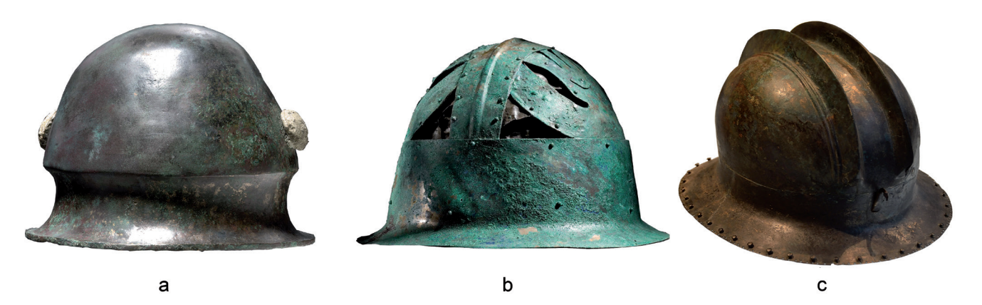
Fig. 1. Helmets: a – bossed helmet with a brim sold by Hermann Historica auctioneers in 2009. Courtesy of Hermann Historica; b – composite helmet sold by Hermann Historica in 2010. Courtesy of Hermann Historica; c – double-crested helmet found in Klenik near Vače, Slovenia. After Božič 2014, Abb. 1.