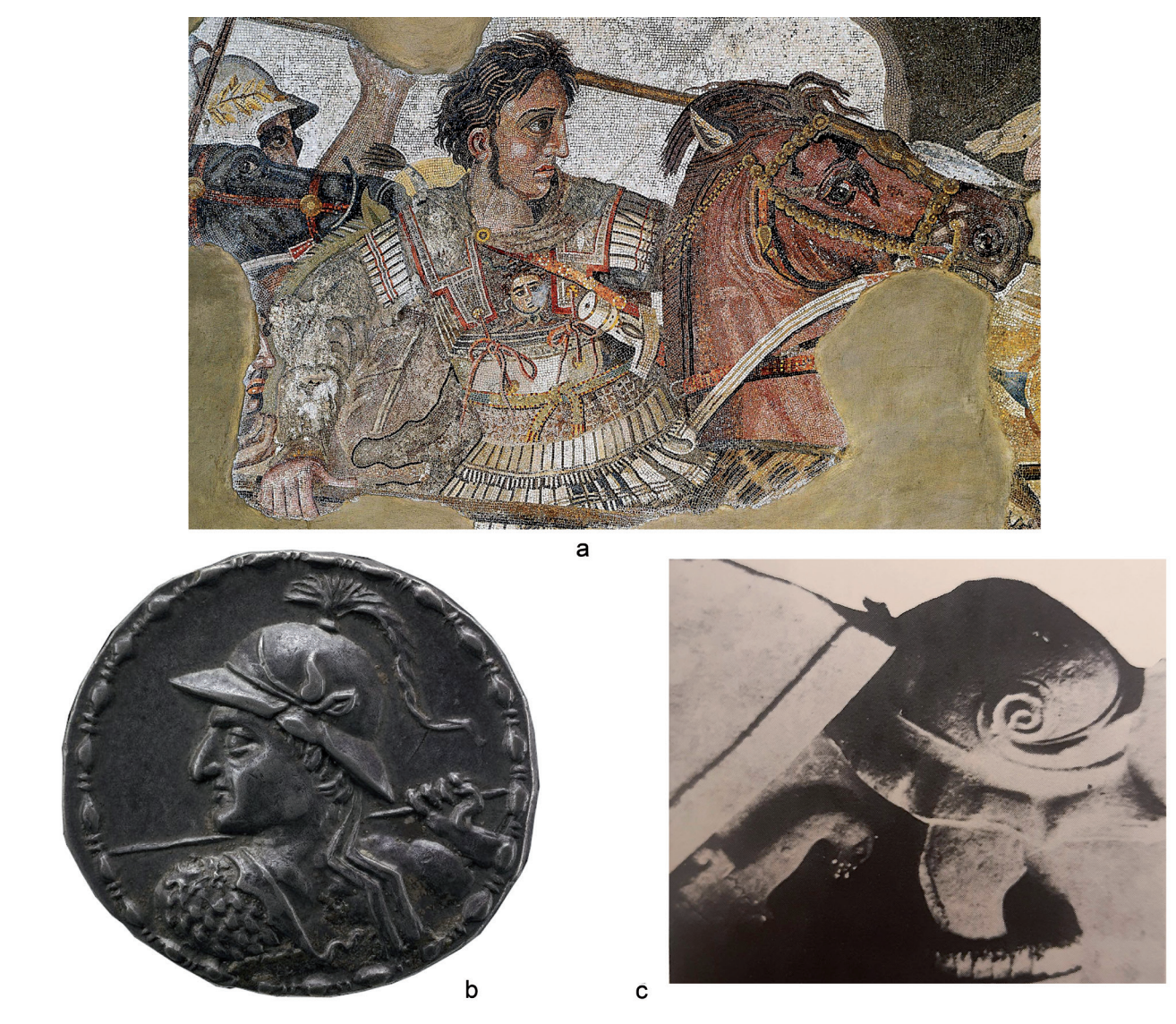
Fig. 3. a – fragment of the Alexander Mosaic depicting the Battle of Issus, c. 100 BC. After Cohen 1997, Pl. II; b – coin of the Archebius, 90-70 BC. After Egg 1988, Abb. 31; c – relief from the Pergamon Altar, c. 183 BC. After Waurick 1988, Fig. 30.

was lost during the invasion of Persia, whereas the above-mentioned four limestone forms in Memphis could be the result of the expansion of Alexander's empire into Egypt.