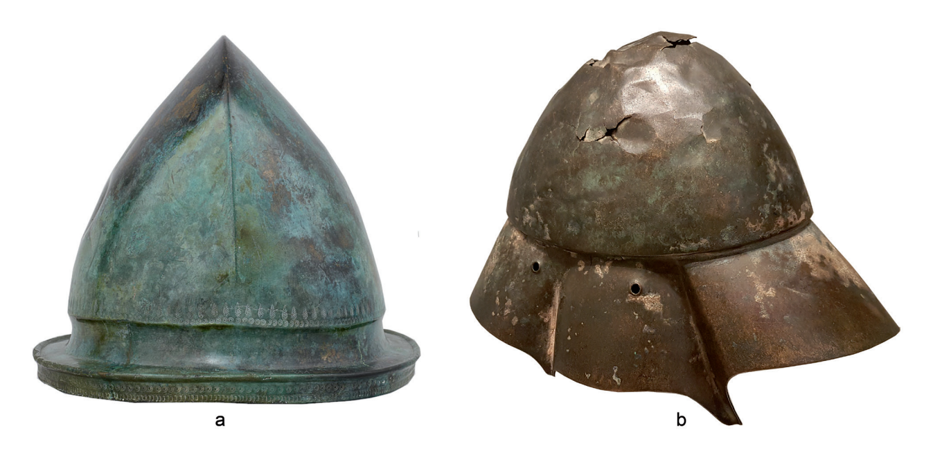
Fig. 2. Helmets: a – Negau helmet sold in Hermann Historica in 2005. After Hermann Historica. 49. Auktion, lot. 182; b – Boeotian helmet from Ashmolean Museum.

gained so much popularity over time that ultimately it became the symbol of Hermes, god of roads and travellers.<sup>15</sup> It was also keenly worn by horsemen, so in the 5<sup>th</sup> century BC its bronze version appeared, designed specifically for cavalry. This helmet had a shape that was very similar to that of the original petasos, i.e., a domeshaped skull and a wide brim with a single fold on each side. The edge of the brim was punched, so the helmet could be covered with felt to protect it from overheating. An original example of such a helmet was found in 1971 in one of the tombs in Athens and is currently kept in the National Archaeological Museum in Athens.<sup>16</sup> Furthermore, such headdresses often appear in paintings and on coins depicting warriors on horses from the 5<sup>th</sup> and 4<sup>th</sup> centuries BC, mostly from regions of Thessaly, Boeotia, and Athens.<sup>17</sup>