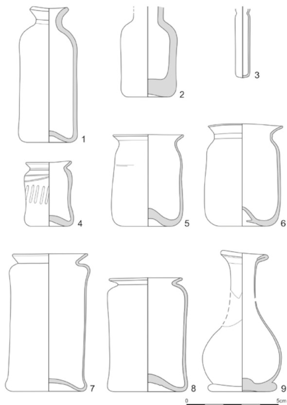
Fig. 5. Selected glass vessels from the court pharmacy in the Saxon Palace in Warsaw. 1, 2 – bottles; 3 – ampoule; 4–8 jars; 9 – vial, so-called zakonniczka . Drawing by U. Skwara-Nieckuła.