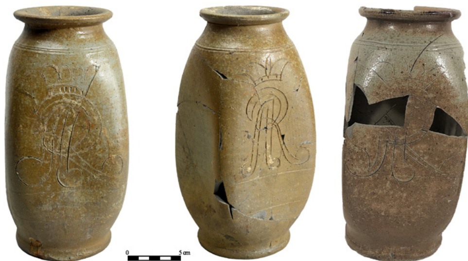
Fig. 1. Stoneware jars from the Saxon Palace in Warsaw.

The royal monogram of the Saxon rulers of Poland – crowned, intertwined letters “AR” – is incised on one side of the vessels (Fig. 1). The monogram on the jars is exactly