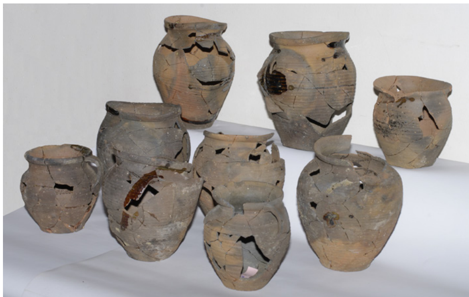
Fig. 4. Selected ceramic vessels from the pottery kiln from Puck, dated to the mid-16th century.

ceramic fabrics, the walls of the vessels were noticeably thinner and of more delicate structure, which corroborates the hypothesis that the techniques of pottery production had changed. This, in turn, would imply that wheel-throwing was used by the time. The fact that the use of this technique has been confirmed in several places may be considered plausible proof of its being known and used in other urban centres of Pomerelia. It is necessary to remember that the ceramic products market was highly integrated and that the guild structures functioning at the time required aspiring craftsmen to travel and gain practical experience, and this fostered the rapid spread of adaptations or innovations in manufacturing techniques (Tandecki 1986: 276–280). However, the exact moment of the increase in frequency of the use of wheel-throwing is hard to pin-point. On the basis of the currently available data, an approximate time-frame for this process should be determined to have lain between the middle and the end of the 16th century.