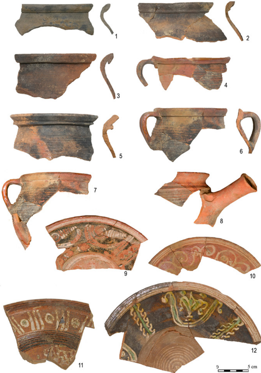
Fig. 5. Selected ceramic vessels from the cesspit at S. Wyszynskiego Street in Lębork, dated to the end of the 16th century (1–8 – pots and grapens; 9–12 – plates).