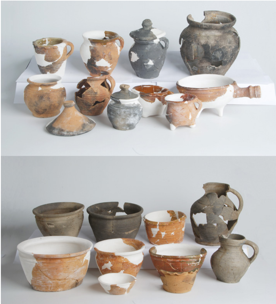
Fig. 2. Selected ceramic vessels from Puck from the end of the 15th and early 16th centuries.