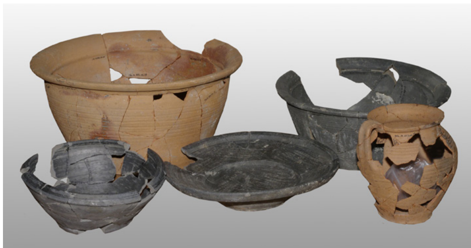
Fig. 6. Selected ceramic vessels from the pit within the urban plot adjoining the market square in Debrzno, dated to the second half of the 16th century.

middle of the 15th century. A certain number of such vessels have been registered in Chojnice, Gdańsk, Łębork, Puck, and Skarszewy in layers dated to the third quarter of the 15th century (Trzeciecka and Trzeciecki 2002: 155–156; Kościński 2003: 364; 2020: 30–36; Starski 2016: 204–206; 2017: 241–242). Their frequency typically amounts to about a dozen percent, reaching 20% in Gdańsk and Puck in the first quarter of the 16th century (Tab. 1). However, it remains unknown how firing in an oxidising atmosphere spread in the subsequent decades of the 16th century. The assemblage obtained from the potter's kiln in Puck dated to the mid-16th century is not entirely representative in that regard, as it is smaller than other production sites and most likely reflects a single batch of pottery (Starski 2019). It cannot be denied, on the other hand, that it was designed to produce an oxidising atmosphere and fire redware (Fig. 4). This type of vessels is also prevalent in the vicinity of the workshop, in what is interpreted as a heap of discarded products. It is noteworthy that the majority of these vessels were not glazed, with glazing preserved on less than 20% (Starski 2019: 110–111). Analogous data were provided by slightly less numerous assemblages from a latrine on Wyszynskiego Street in Łębork, a cesspit on Zduńska Street in Skarszewy, and the refuse dumping pit in an urban plot in the southern frontage of the market square in Debrzno (Tab. 1; Fig. 6). 5