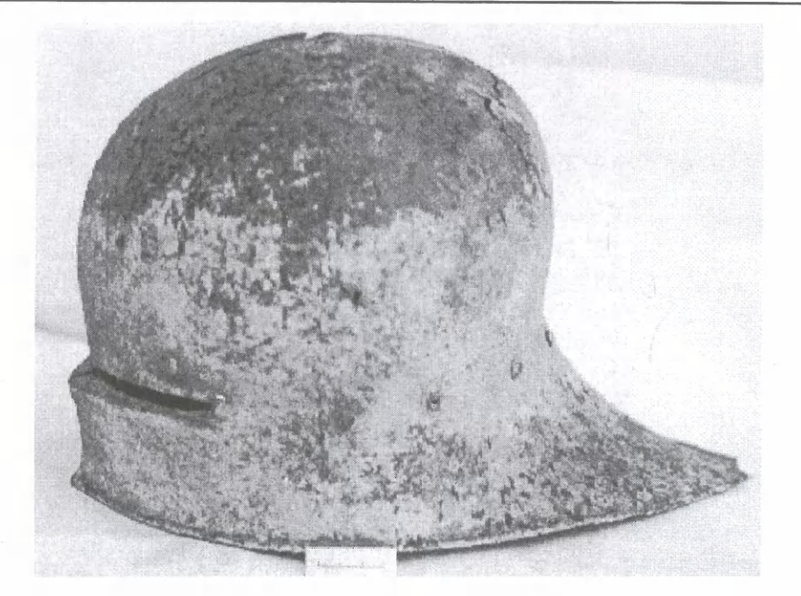
Fig. 5. Helm from Mscislav. Left side view.

Such a sallet was first found in Eastern Europe. A sallet with a full skull can be found in neither East-European nor even Polish iconography<sup>3</sup>. Some closer analogies can be seen in the collection of Museum für Deutsche Geschichte in Berlin<sup>4</sup>. The helm, dated at the 1470s, was made in an armourer's workshop in Nurnberg, as evidenced by the municipal and the armourer's signs placed on the neck-guard.