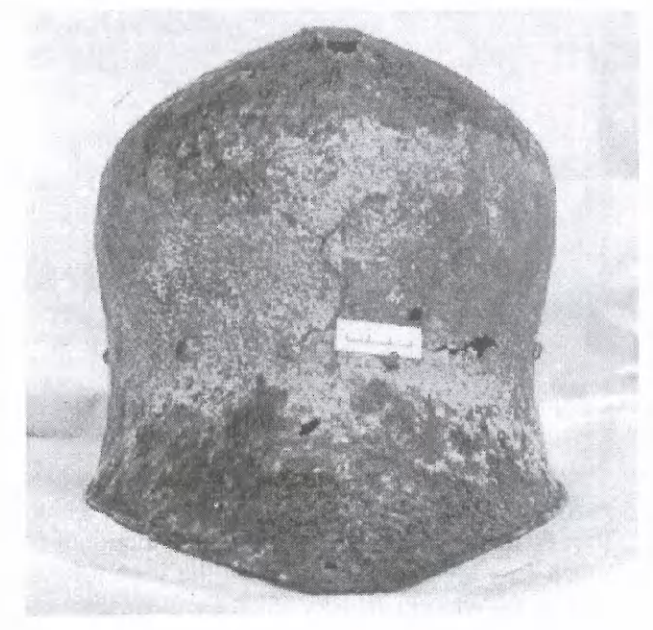
Fig. 4. Helm from Mscislav. Back view.

<sup>1</sup> H. Müller, F. Kunter, Europäische Helme aus der Sammlung des Museum für Deutsche Geschichte, Berlin 1984, p. 31; Z. Żygulski Jr., Brońw dawnej Polsce na tle uzbrojenia Europy i Bliskiego Wschodu (Arms in Old Poland against a Background of the Arms and Armour of Europe and the Near East), Warsaw 1975, p. 103.