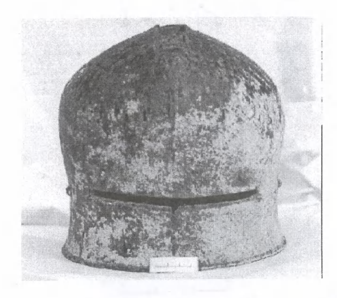
Fig. 3. Helm from Mscislav. Front view.

Before it was cleaned, the helm weighed about 2100 g. It was made from one piece of iron. The skull is characteristically rounded. On the sides, the edges are turned upwards to form a roll, which seems to be slightly bent to the outside, while the rear part smoothly changes into the longish neck-guard (Fig. 1).