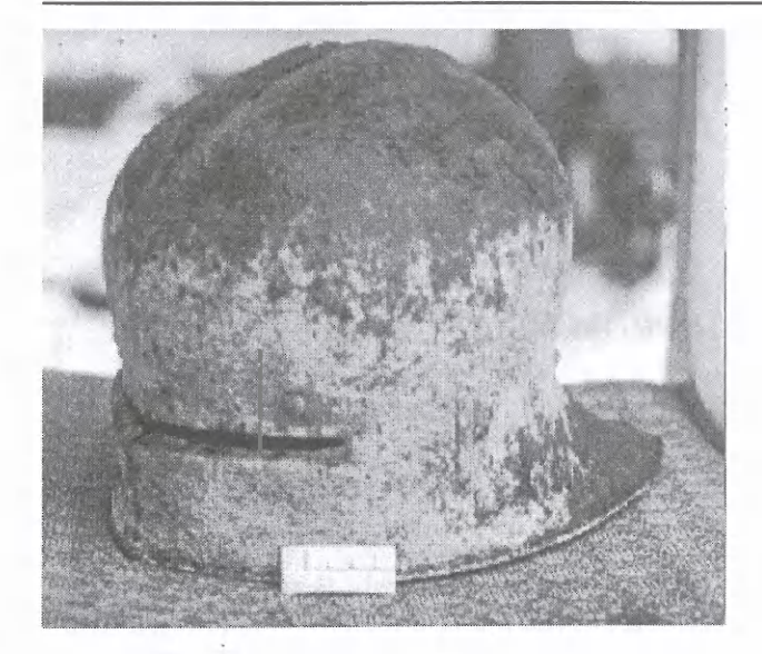
Fig. 2. Helm from Mscislav after finding.

that is, visors, which covered the upper part of the face, and a long, curving neck-guard<sup>1</sup>. Similar helmets were the most popular head covering in Central Europe in the middle and the latter part of the fifteenth century.