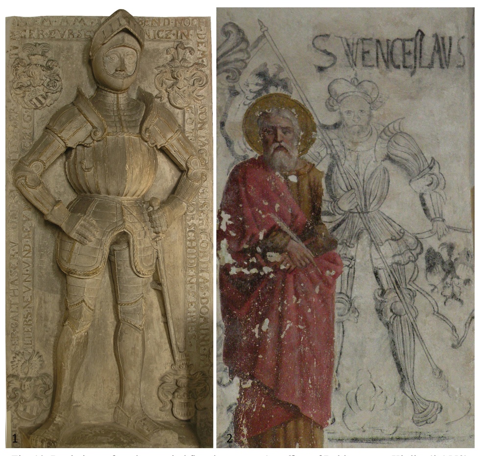
Fig. 10. Depictions of modern period fluted armours: 1 – effigy of Balthasar von Kittlitz († 1553) from the church of St. Martin in Świdnica. 2 – St. Wenceslaus from frescoes painted on the eastern wall in the Parish Church of John the Baptist in Międzyrzecz. c. 1545.

Quite quickly, fluted armours, the reminiscence of the Maximillian style, popular in various regions of the Empire throughout the 16th century and also at the beginning of the 17th century,55 became fashionable in many variants and varieties also in analysed area. Flutes were transformed here into wide bands, with gilded ridges, decorated with a rope motif or etched appliqué. It should be mentioned here two evidences that testify the use of this type of body defences. First, we need to discuss the effigy of Balthasar Kittlitz († 1553) from the church of St. Martin in Świdnica<sup>56</sup> (Fig. 10:1). Similar armour appears on the polychrome with depiction of St. Wenceslaus from the Parish Church of John the Baptist in Międzyrzecz. Frescoes from there were probably painted in 1545. Their foundation can be attributed to the starosta of Międzyrzecz, Laurentius Myszkowski, who bore the Jastrzębiec coat of arms, from the Lesser