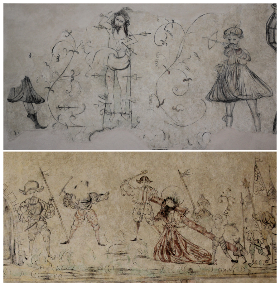
Fig. 5. Martyrdom of St. Sebastian and Carrying the cross scenes from frescoes painted on the eastern wall in the Parish Church of St. John the Baptist in Międzyrzecz. c. 1545.

in hunting spears are also known from the iconography of the early 16th century. 22 Artefacts with polygonal sockets and deltoid-shaped blades were used constantly in the Modern Period; for instance examples from the collection of Styrian Armoury in Graz comes from the 4<sup>th</sup> quarter of the 16<sup>th</sup> century.<sup>23</sup> Due to the powerful blade this type of weapon could have been successfully used not only during hunting, but also on the battlefield. These spears were employed quite often in combat, especially by support personnel, sentries and other rear echelon troops. A spear with a movable bar depicted on the woodcut of Altdorfer, from his series Triumphal Procession of Emperor Maximilian, dated to 1517, was shown in the hands of a wagon soldier.<sup>24</sup> The so-called Bärenspiess or Schweinspiess appears occasionally in arms inventories of castles in the Habsburg lands (see for example the Zeugbücher of Maximilian I).<sup>25</sup>