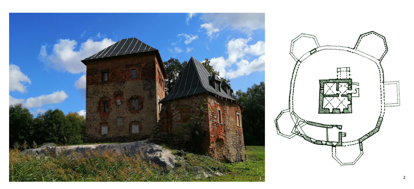
Fig. 2. Witków (Wittgendorf): 1 – the tower house erected c. 1400, by the members of Warnsdorf family. 2 – with bastions built in the 1st half of the 16th century. After Kowalski 2010.

of Ottoman Turkey also affected the situation in Central Europe. In the Late Middle Ages the territory of the mid-Odra Region was the arena of struggle between the Silesian Duchies, the Kingdom of Poland, Brandenburg and the Kingdom of Bohemia. The territorial status quo established during the 15<sup>th</sup> century, was significantly changed during the War of the Głogów Succession (1476-1482), when the crucial Ziemia Krośnieńska (Germ. Crossen/Crosno land)