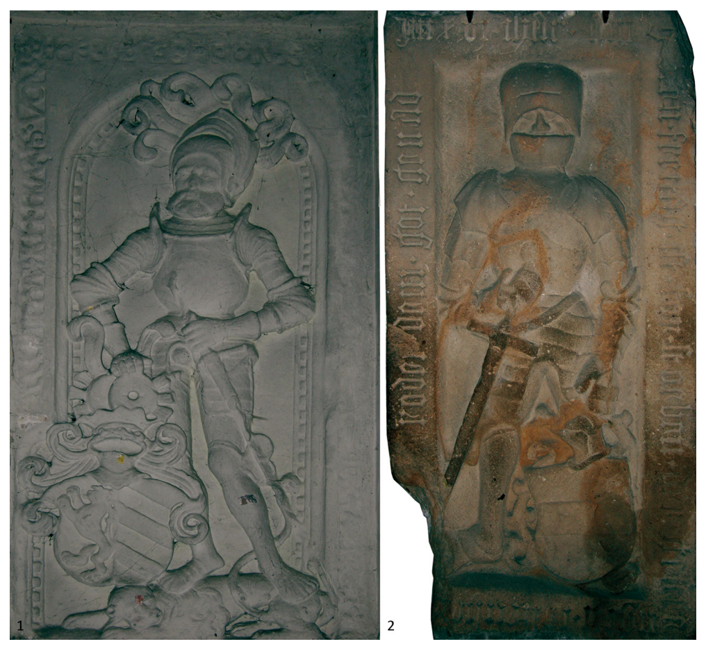
Fig. 7. Depictions of modern period innovations in arms and armour: 1 – effigy of Franc von Rothenburg from the church of the Assumption of Our Lady in Leśniów Wielki, c. 1532; 2 – Effigy of Heinze von Röder († 1517) from the Parish Church of the Visitation of Our Lady in Lubsko, after 1517.

However, in the light of the iconography of area in question, they were not very popular and appeared a bit later than in the rest of Europe. The earliest, known example is most likely the armour from the effigy of the mayor of Lubsko, Frans Rothenburg, from the church of the Assumption of Our Lady in Leśniów Wielki, Zielona Góra District dated to c. 1530. It is covered with a thick layer of plaster, which makes the full recognition of all its elements difficult.<sup>40</sup> The waist of the globose breastplate is still slender (like medieval ones), but it has no placard. Decoration in the form of a single spray of flutes originating at a common point in the middle of the waist and radiating arched up and out across the chest. Fluting appears also on the pauldron and the cuff of the gauntlet. The lower abdomen and upper thighs are protected by an elongated lamed fauld. The helmet has a modern, fully enclosed form with a beaked visor attached to the lower part of the