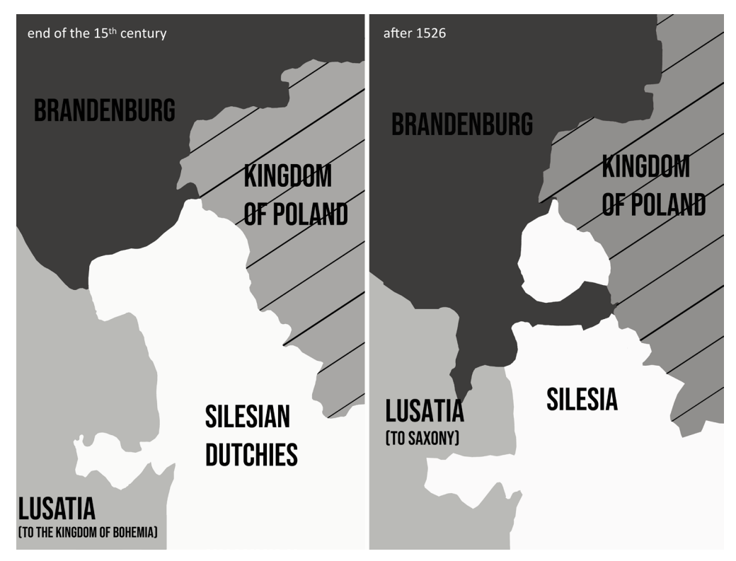
Fig. 1. Territorial changes in the borderland of Silesia, Brandenburg, Greater Poland and Lusatia at the end of the Middle Ages and dawn of the Modern Period. Elaborated by A. Michalak.