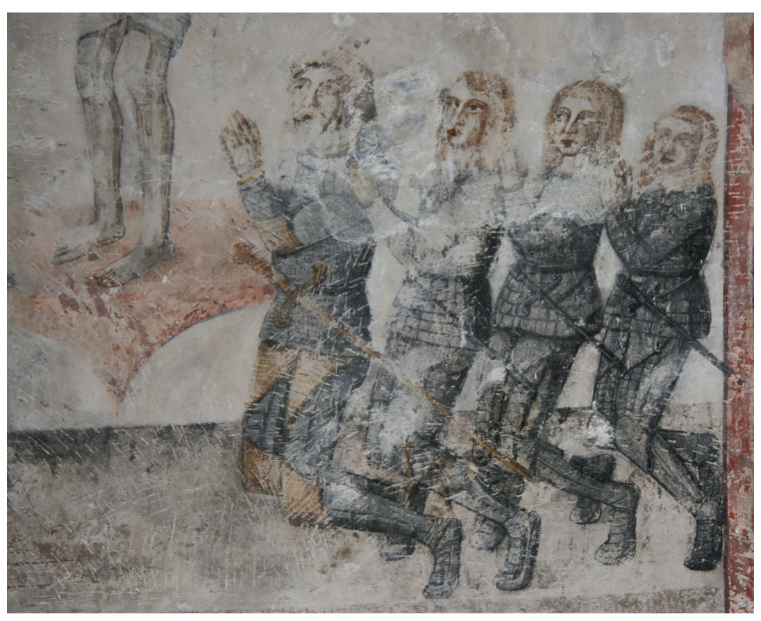
Fig. 12. Depictions of modern period arms and armour from votive image of von Rothenburg family from the church of the Visitation of Our Lady in Lubsko, c. 1520.

the 16th century, but they became out fashioned already in the 1530s.67 The armour from the Vienna Armoury (inv. no. A186), made in Innsbruck by Hans Rabeiler for the emperor Charles V, c. 1511/1512<sup>68</sup> is a close parallel to this breastplate. A similar specimen kept in the Wallace Collection (inv. no. A29) is dated to the 1st quarter of the 16th century<sup>69</sup> or precisely to 1520.<sup>70</sup> Another armour with puffed and slashed decoration is kept in the Musée de l'Armée in Paris (inv. no. G 13).<sup>71</sup> The Deutsches Historisches Museum (inv. no. 2326) poses armour with this kind of decoration, however of simplified form, dated to c. 1510-1515.72 This kind of armour attributed to Hans Rabeiler, is also kept in the Bernisches Historisches Museum (inv. no. 104).<sup>73</sup> It is dated to 1510-1515. Puffed and slashed decoration in the mentioned suits of armour also occurs on tasetts and pauldrons, which, due to being concealed by the