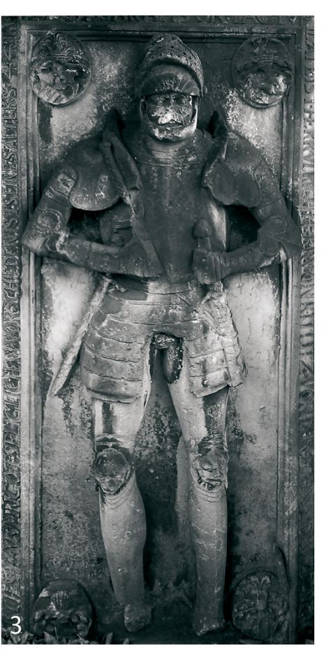
Fig. 11. Depiction of costume armour (1-2) and grotesque elements of leg defences (3): 1-2 – figure of St. George, church in Dzieduszyce (now lost), c. 1520s. After Reißmann 1937; 2 – effigy of Ulrich von Kittlitz from Świdnica († 1568) at the Parish Church of St. Michael Archangel in Nowa Sól.

smaller rectangular plates.<sup>59</sup> An analogous method of decoration is known from many products of South German armourers, dated to the very beginning of the 16<sup>th</sup> century.<sup>60</sup> This construction was also used in the foot combat armour made for King Henry VIII of England.<sup>61</sup> In this armour the surface of the plates from skirt (reaching till the knees) was decorated with etched and engraved Tudor roses and floral decoration with plain fields alternately. Emperor Charles V also owned few types of armour with such skirts.<sup>62</sup>