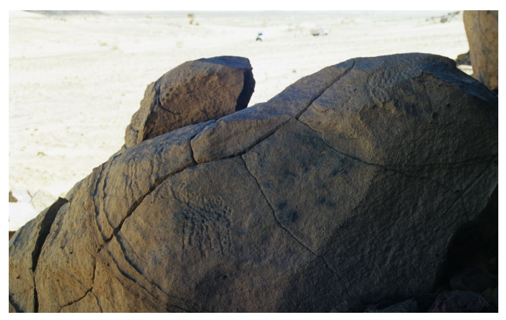
Fig. 7. The petroglyphs at site S01 NP12.

grinding stone made of a highly micaceous granitoid lay in front of the shelter. Large flakes mostly made from a brown fine-grained quartzitic sandstone and partly with edge retouch were present. Only few quartz flakes were observed. Two hammerstones, one made of quartz, as well as one core made of a bright quartzite and one upper grinder were also recorded.