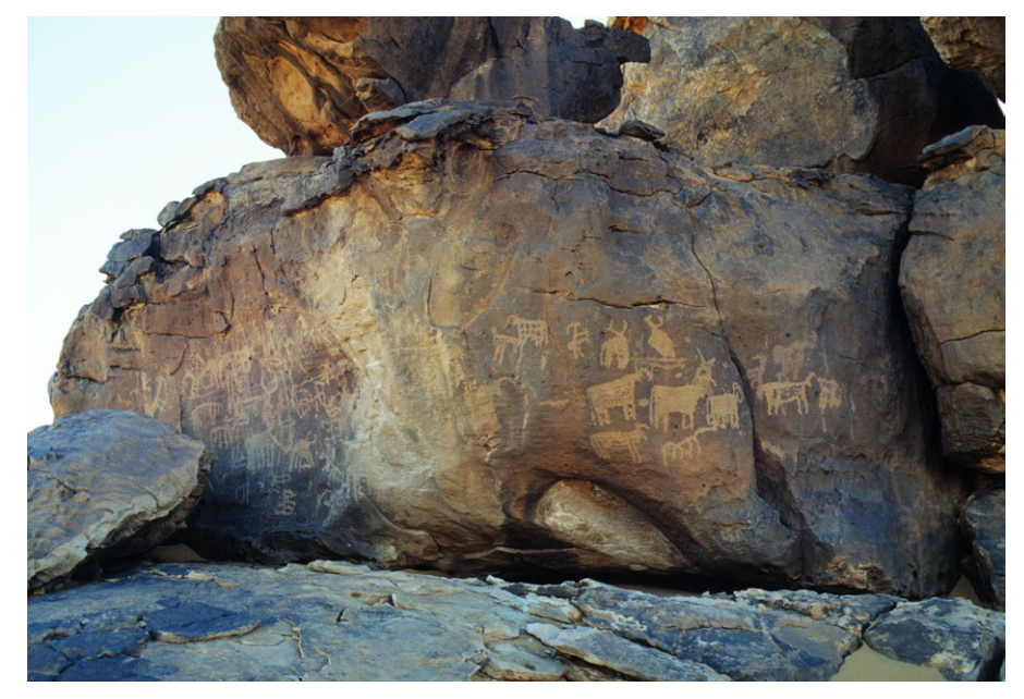
Fig. 4. Zolat el Hammad West. Large frieze with different animals among others a cattle herd at point F.