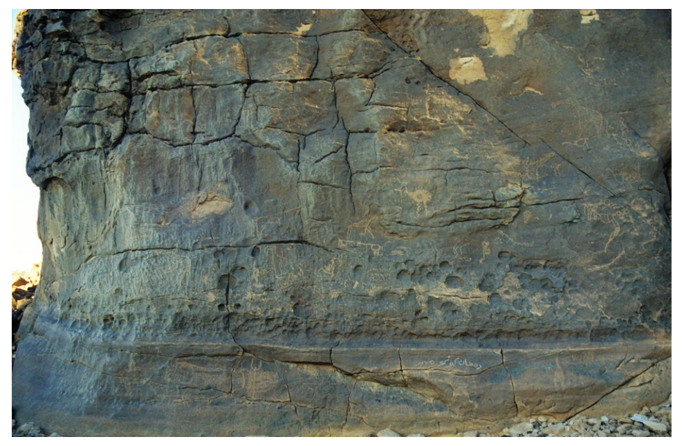
Fig. 2. Zolat el Hammad East, point B. Large frieze with petroglyphs including an Arabic inscription.

A larger panel in Zolat el Hammad East (Fig. 1:II, point B) shows, beside animal representations (giraffes, bovids, ostriches) also an Arab inscription (Fig. 2). The name "Rahmadan Koko Muhdir" can be read. According to our accompanying NCAM inspector Muawiya Ali El-Tayeb, this might be a person coming from the Nuba Mountains as "Koko" is a common name there for the eldest son.