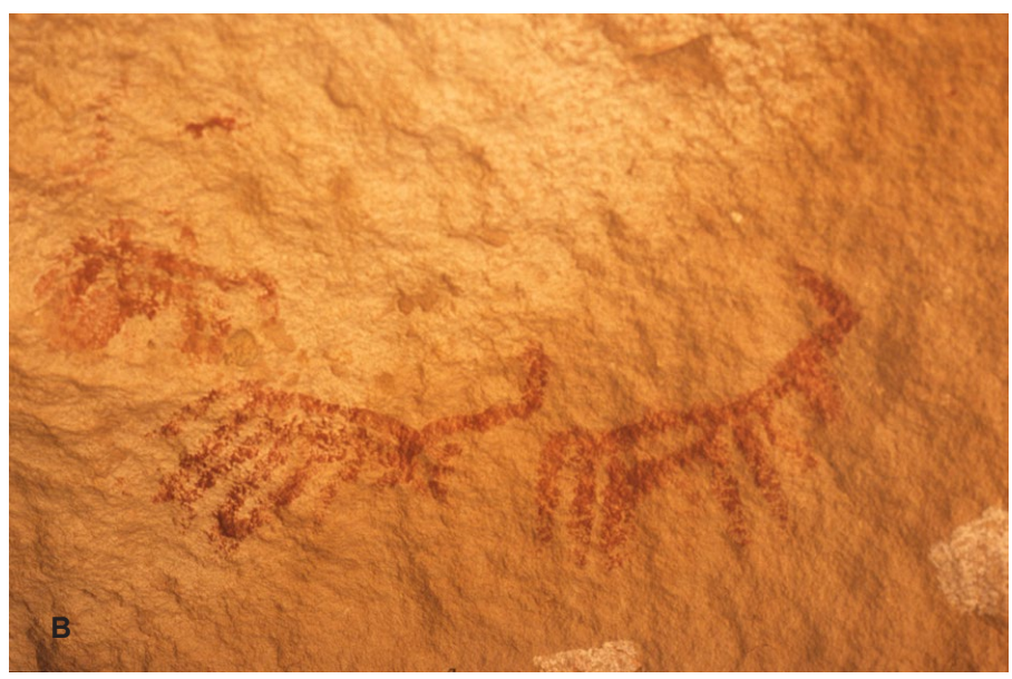
Fig. 6. Site S97 RK6. A – Overview of the site; B – Schematic paintings of bovids in red colour.