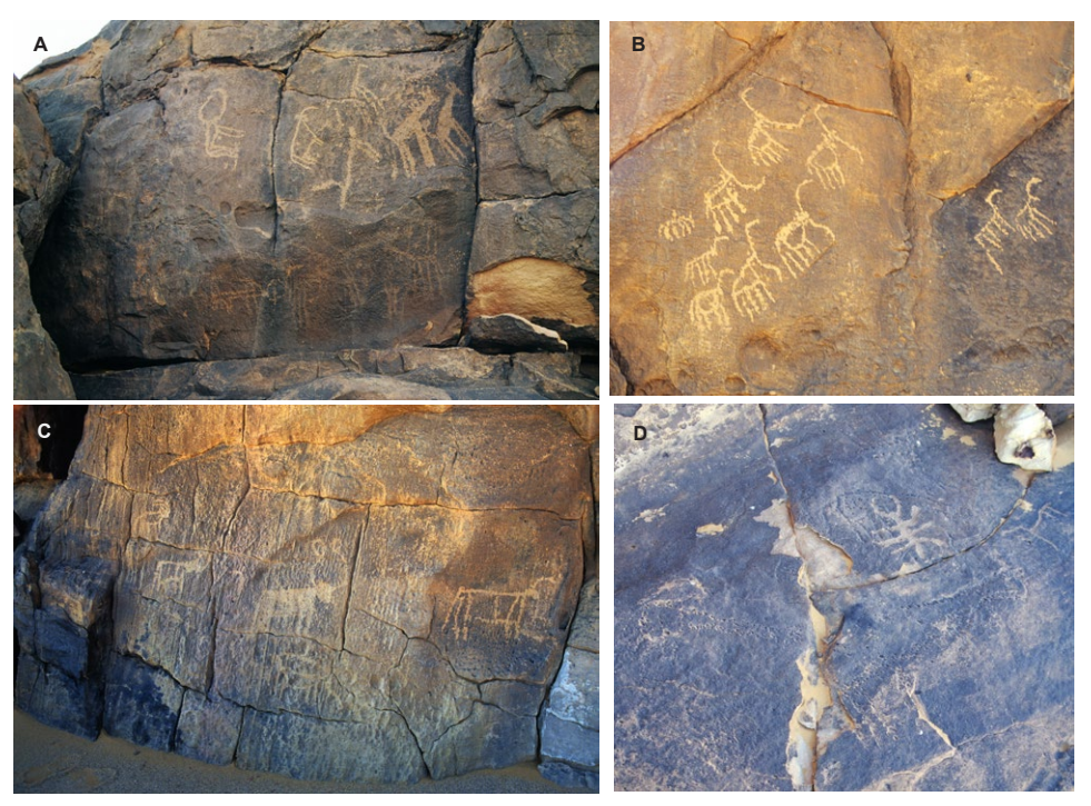
Fig. 3. Zolat el Hammad West. A – Petroglyphs at point E; B – Petroglyphs at point H; C – Petroglyphs at point K; D – Petroglyphs at point J.

of dotted lines (Fig. 3:D). At point K (Fig. 1:II) gazelles respectively antelopes (possibly Oryx?) were found as well as cattle with pronounced horn deformation (Fig. 3:C). This can best be classified in the category of lyre-shaped horns (Rhotert 1952: 102, table), but this representation is much more elaborate than the examples mentioned there. On the eastern side of a large stone block (Fig. 1:II, point D) giraffes, bovids, a human figure, goats and dogs are engraved (Fig. 5). Directly in front of it lay a block chipped off from this stone, which was also densely engraved with giraffes on the chipped side.