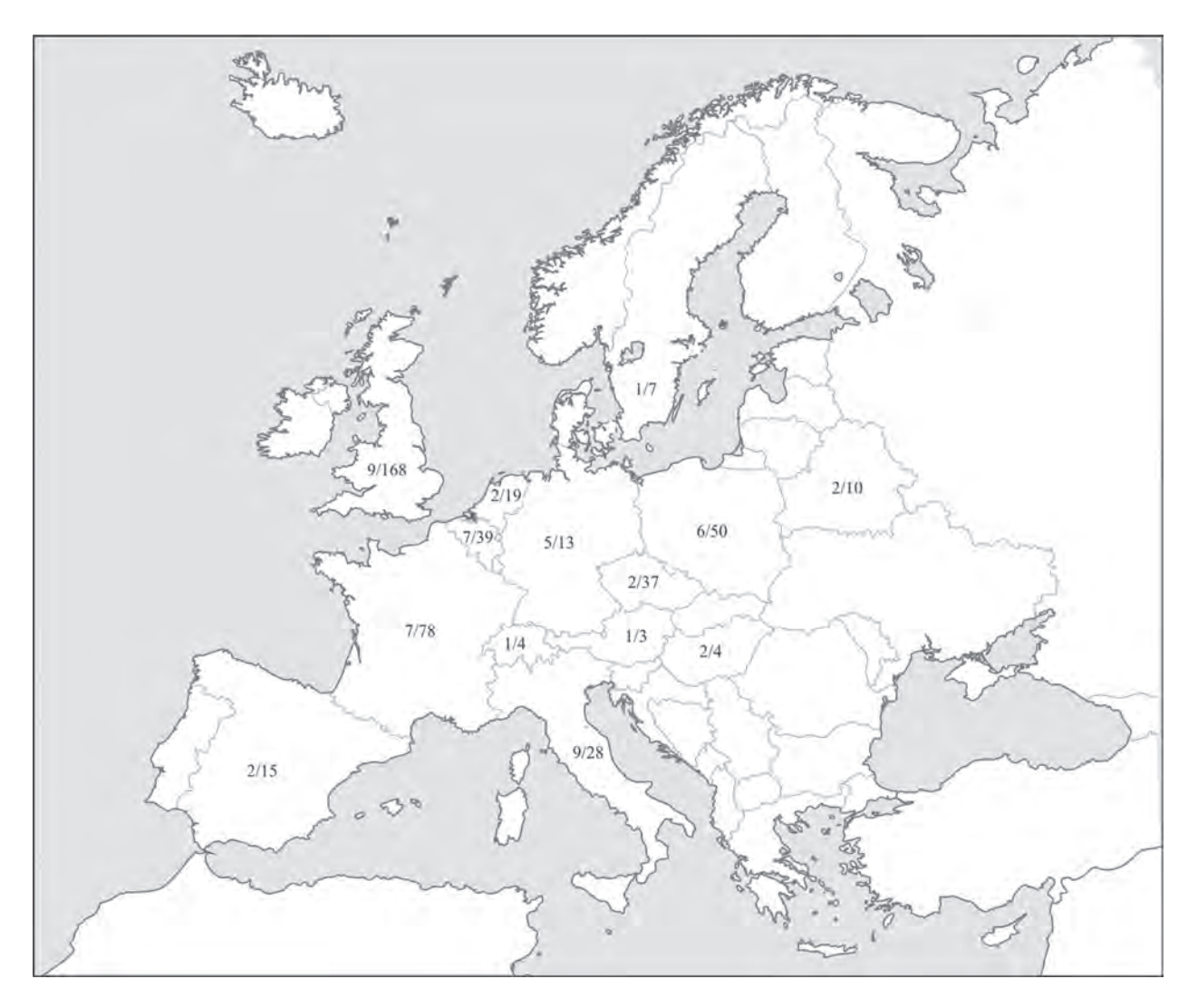
Fig. 1. Map of Europe with the distribution of radiocarbon dates compiled for this paper. Figures in each country represent number of dated mines/total number of dates. Drawn: S. Consuegra and P. Díaz-del-Río.

These datings are not homogeneously distributed over the continent. Twelve countries from South-eastern Europe have no radiocarbon dates, even though many of these nations are home to the oldest evidence of the continent's Neolithic settlement and are known for the quality of their raw materials. Some 51% of the datings come from the United Kingdom and France (Fig. 1), and just 12 mines or mining districts concentrate 60% of the available data. Further, nearly 30% refer to Grime's Graves, making this the best dated prehistoric flint mine in the world (Longworth et al. 2012).