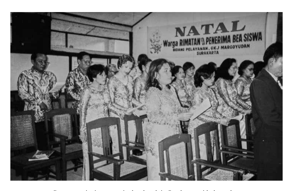
Protestant singing group in the church in Surakarta, with the author