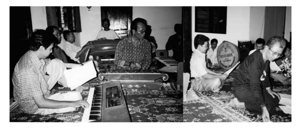
Rehearsal of a Protestant group (Joyotakan church, Surakarta)

Motivated by both religious and aesthetic considerations, some Christian composers strive to compose songs that are perceived as aesthetically distinct from traditional Javanese songs (for example, Wignyosaputro<sup>15</sup> and Surono). Hence, the more common use of: the 7-tone pelog scale, which evokes the Western diatonic scale (and