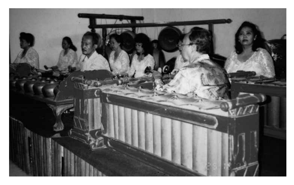
Female ( ibu-ibu ) gamelan group, with a few male guest players (San Inigo Catholic church, Surakarta)