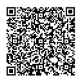
Audio recording 1

The most controversial of traditional genres that I studied in the Javanese Christian context<sup>11</sup> was kentrung <sup>12</sup>. Kentrung is an Islamic music genre, as well as an ensemble consisting of frame drums of different sizes, called rebana or terbang <sup>13</sup>. Because of its association with Islam, kentrung's presence in the Christian church is a contested topic. Opinions on kentrung vary significantly. Although