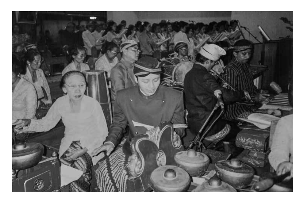
Gamelan group and choir, joined by a violin player (Purbowardayan Catholic church, Surakarta)

Music performance plays a vital role in identity negotiations at all levels (local, regional, national, global). Christian local communities in Indonesia musically redefine themselves, while acting against social ostracism and re-establishing connections with society at large (see Wiebe 2017). Performing local Christian music in churches is a way of claiming national space by Indonesian Christians (see fig. 5). It stems from the