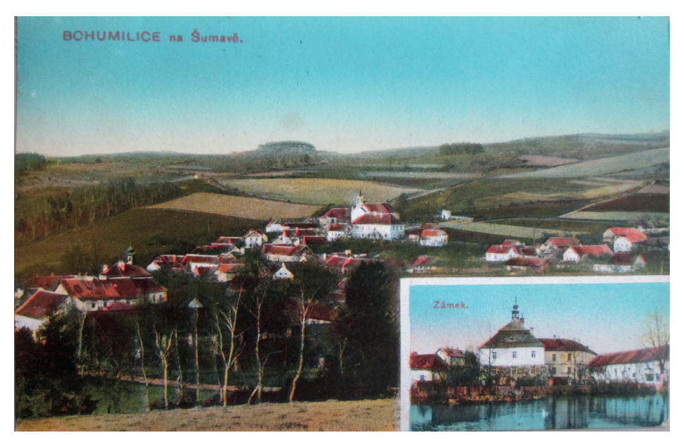
Bohumilice na Šumavě (the landscape of Šumava on period photographs), private archive of B. Soukupová