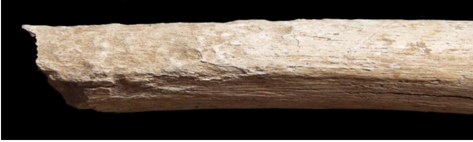
Fig. 1. Femoral bone fragment with extensive post-mortem damage