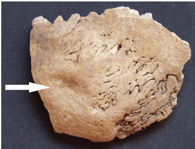
Fig. 4. Fragment of the occipital bone with ante-mortem depressed fracture