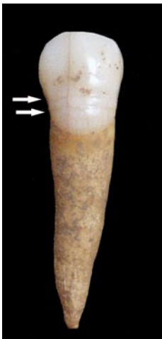
Fig. 6. Maxillary canine with dental enamel hypoplasia