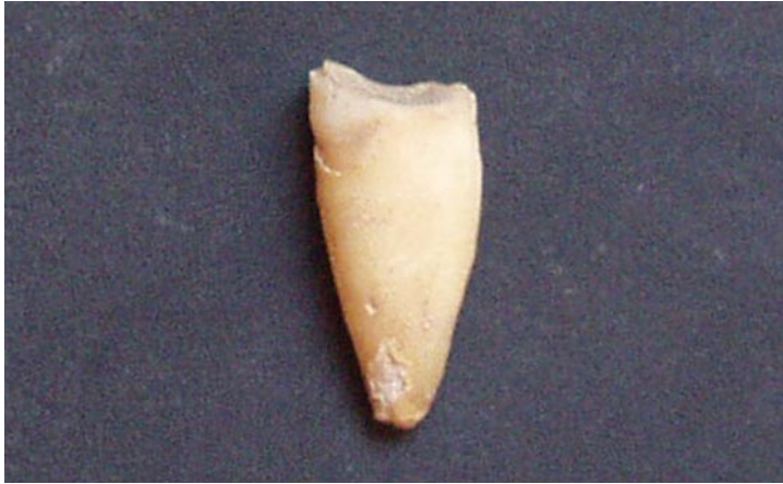
Fig. 8. Severe abrasion of the occlusal surface of the maxillary premolar