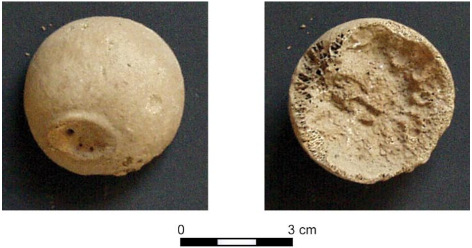
Fig. 3. Unfused proximal femoral epiphysis belonging to a young adult individual (16–20 years)