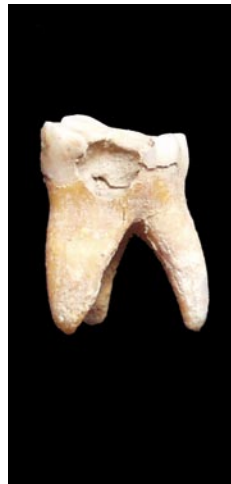
Fig. 7. Interproximal caries on the maxillary molar