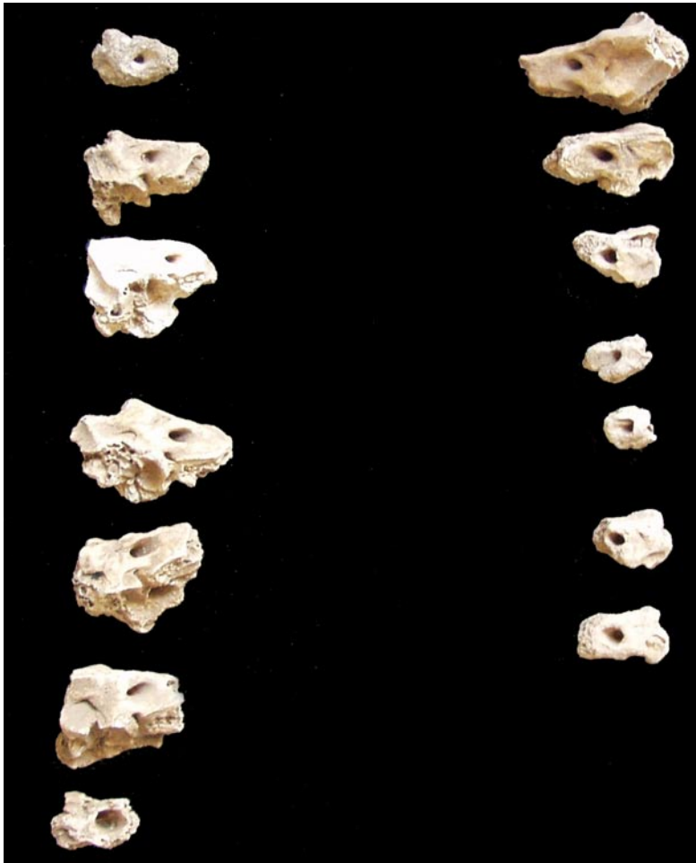
Fig. 2. Fragments of seven right and seven left temporal bones