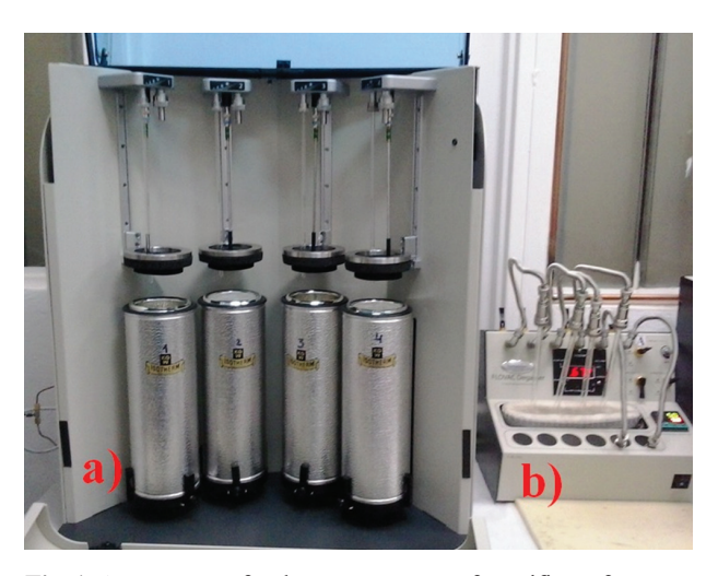
Fig. 1. An apparatus for the measurement of specific surface area (a) and a sample degassing station (b).

Specific surface area measurements were performed using a Quadrasorb Evo analyzer (Quantachrome Instruments). This apparatus consists of a FLOVAC Degasser degassing station and an analytic station, both of them shown in Fig. 1. The analyzer is equipped with a computer software which helped to control the experiment and