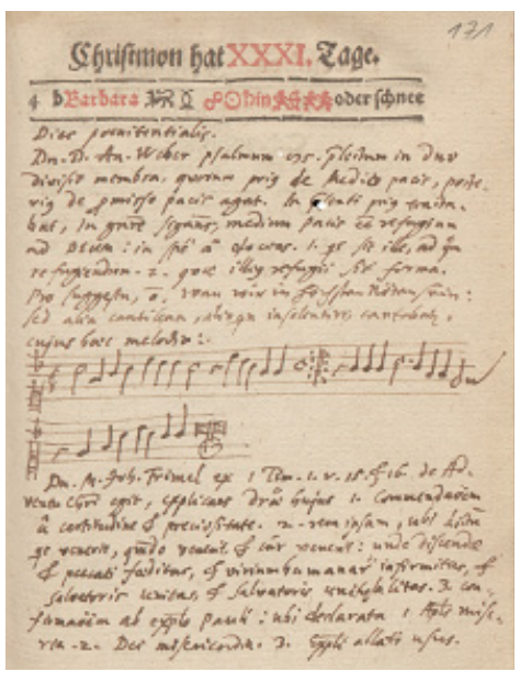
Fig. 2. Wrocław, Biblioteka Uniwersytecka, Oddział Rękopisów, R 2347, fol. 171rec. [4 Dec. 1648]