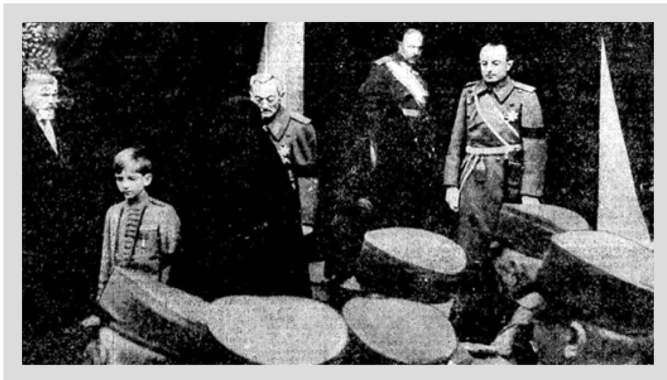
4. Meaningful photo taken at King Alexander's funeral; left to right: Peter II, heir to the throne, with his mother dressed in black, Prince Arsen, paternal uncle of the murdered monarch, and Arsen's son, Regent-Prince Paul, cousin of King Alexander I and de facto leader of the Kingdom of Yugoslavia after the latter's death; after: "Престоница и душа Југославије, Београд, велики у своме болу, опростио це јуче са својим витешким краљем ујединитељем", Политика , 9491 (19 October 1934), p. 1.

surrounded by chevaliers of the Order of Karadžorđe's Star and clergymen, patriarchs and bishops of other denominations. The presence of one more participant was particularly moving: the monarch's favourite horse led by two royal guards. Behind the stallion, the supreme commanders of the Yugoslav Army were carrying the royal insignia. Next were about thirty slowly rolling cars carrying wreaths from the people and officials, finally followed by the modest coffin with the remains of the king, drawn by a team of four horses. Behind the coffin walked the monarch's son, Peter, wearing a Yugoslav Falcon outfit, his mother, Queen Maria, and all members of the Karadžorđević family, followed by delegates of foreign states, and then – masses of Yugoslav citizens. 88