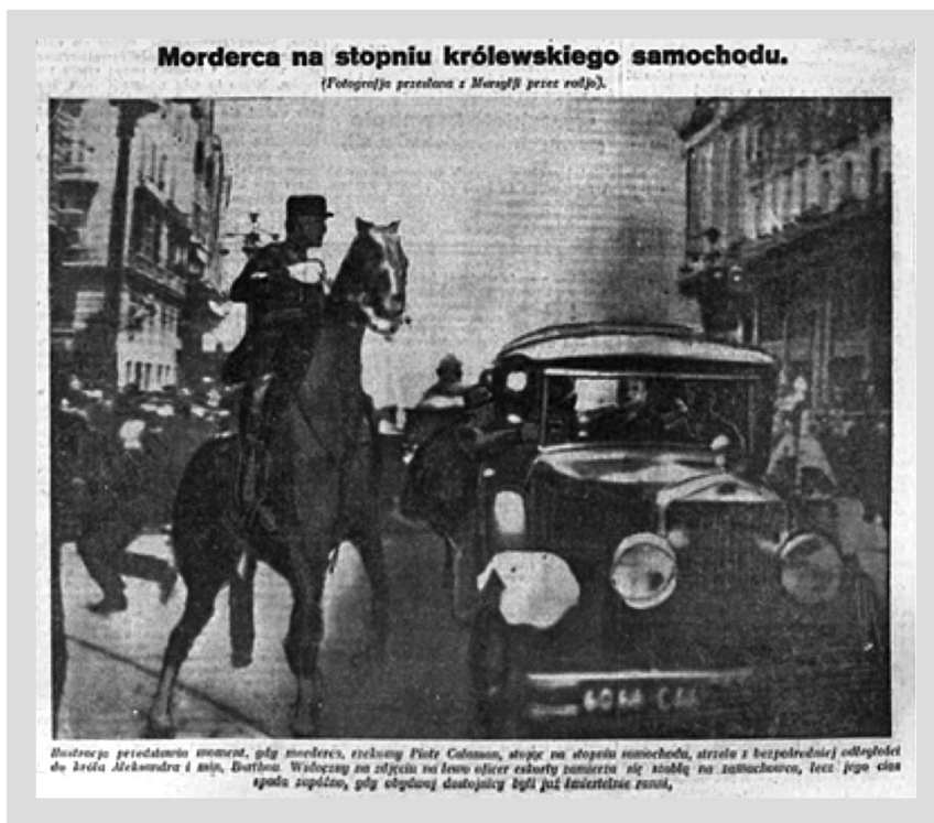
3. Photo of the moment of the attack in Marseilles; after: “Tajemnica spisku na króla Aleksandra i min. Barthou”, Ilustrowany Kuryer Codzienny , 283 (12 October 1934), p. 1.