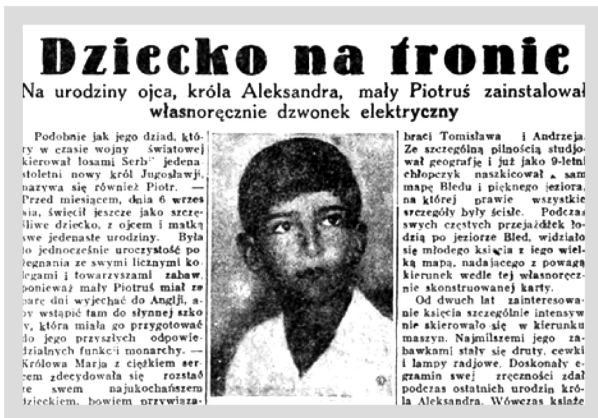
5. Fragment of an article on the then 11-year-old King Peter II; after: “Dziecko na tronie”, Głos Poranny. Dziennik Polityczny, Społeczny i Literacki , 282 (12 October 1934), p. 2.