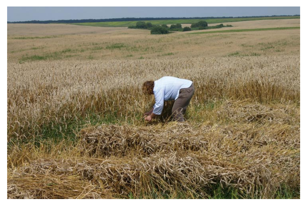
Fig. 3. Wheat harvesting with experimental sickles