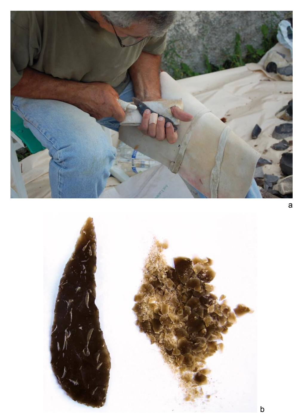
Fig. 10. Experiments in making replicas of the Vysotskaya culture flint sickles: a — process; b — sickle