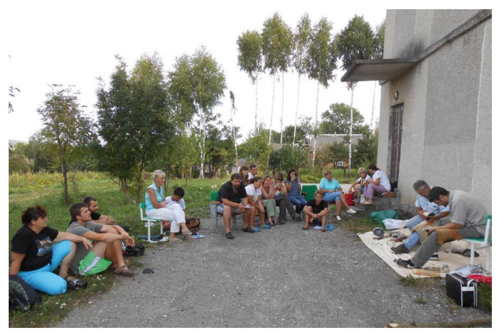
Fig. 4. Participants of the Experimental-Traceological School-Seminar