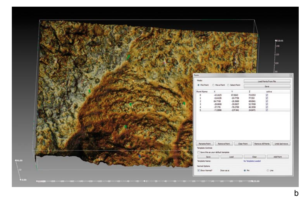
Fig. 7. a — H. Plisson lecturing on modern methods of use-wear macro-traces recording; b — example of a three dimensional recording of an archaeological use-wear micro-polish by using the Ukrainian software Helicon Focus