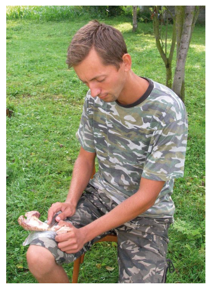
Fig. 9. Experiments in working bone