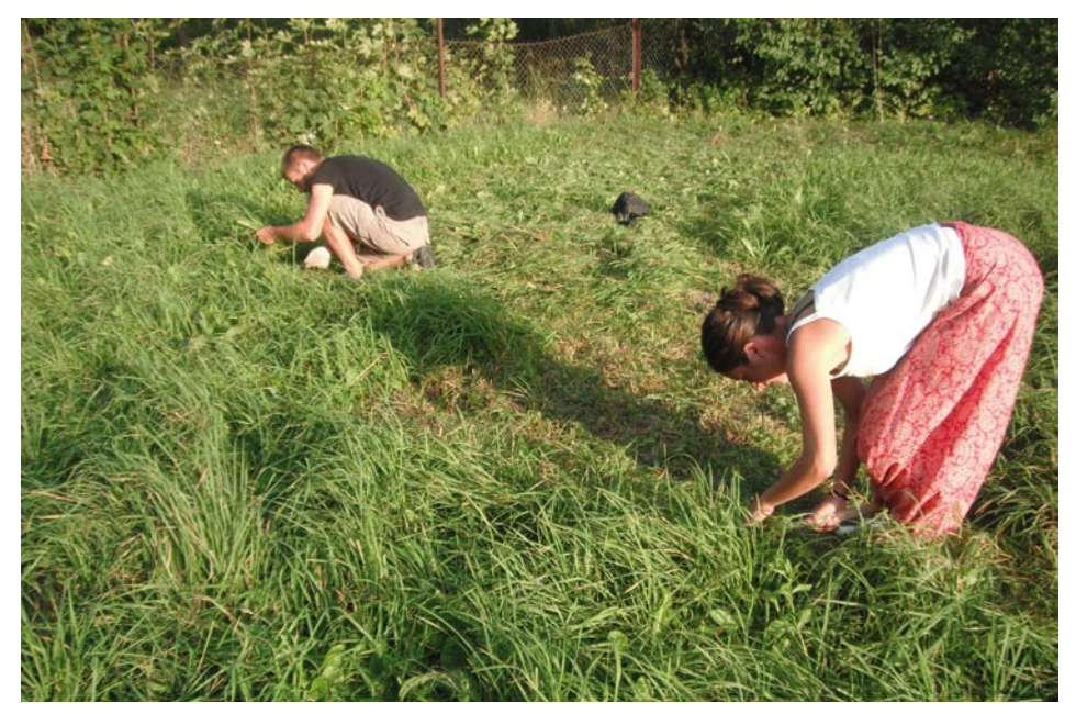
Fig. 2. Experiments in cutting of plants