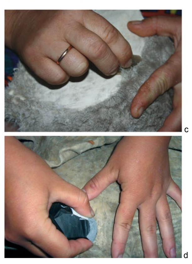
Fig. 8. Experiments in working: a — wood; b–d — skin