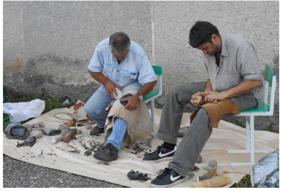
Fig. 6. a-c — experiments in flint working