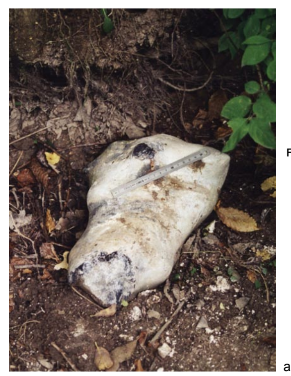
Fig. 1. a-b — Volhynian flint outcrop near the Tripolian settlement of Bodaki (Ternopol region of Ukraine)