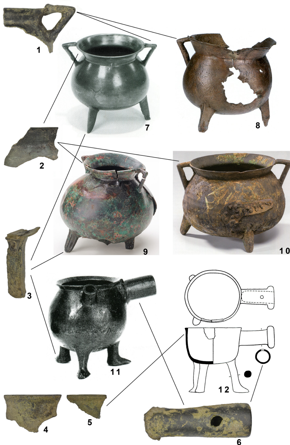
Fig. 5. Fragments of copper alloy vessels from Mierzyn and corresponding selected analogies from Central Europe: 1 – Mierzyn, inv. no. 08/28/08; 2 – Mierzyn, inv. no. 08/21/07; 3 – Mierzyn, inv. no. 15/07/21; 4 – Mierzyn, inv. no. 05/13/07; 5 – Mierzyn, inv. no. Mr 45/2021; 6 – Mierzyn, inv. no. 01/21/07. Photo (1-6): P. Strzyż; 7 – Szczecin (PL), National Museum. Source: Majewski 2003, 66-67, no. 12; 8 – Gdańsk (PL), Długie Ogrody. Source: Ceynowa 2021, 163; 9 – Soest, Kr. Loco (DE). Source: Heinze and Tegethoff 2018, fig. 3; 10 – Lahmen, Kr. Rostock (DE). Source: Wollschläger 2022, fig. 335; 11 – Csongrad (HU), National Muzeum. Source: Polgár 2010, fig. 9; 12 – Rajhradice, Brno-venkov district (CZ). Source: Cejpková 2003, fig. 8.

In addition, individual, small fragments are known from Ćwiklice (Pszczyna District) (2 nd half of the 14 th - 1 st half of the 15 th century) and Sądowel (Góra District) (2 nd half of the 13 th -15 th centuries), where the latter may have a trace of a detached handle. In most cases, we are dealing with rim parts, whose slightly outward-bent lips are also characterised by a clearly thickened edge. 14 Recently, the remains