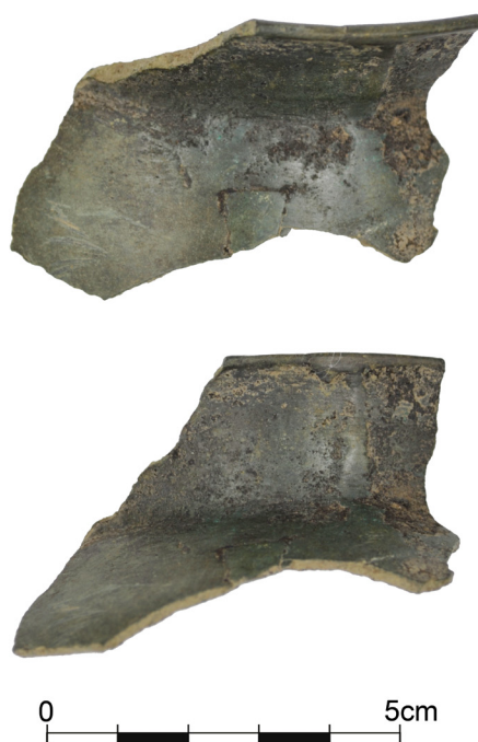
Fig. 4. Mierzyn, fragment of copper alloy Grapen with preserved casting seam and a sign on the body.

The last element worth discussing in more detail is the sleeve-shaped pan handle (Fig. 3:13). It is distinguished by its massive walls and weight (over 200 g), which allows us to assume that it was also intended for a large utensil. As in the case of the leg, it has survived together with part of the body, which indicates that this object was cast in one