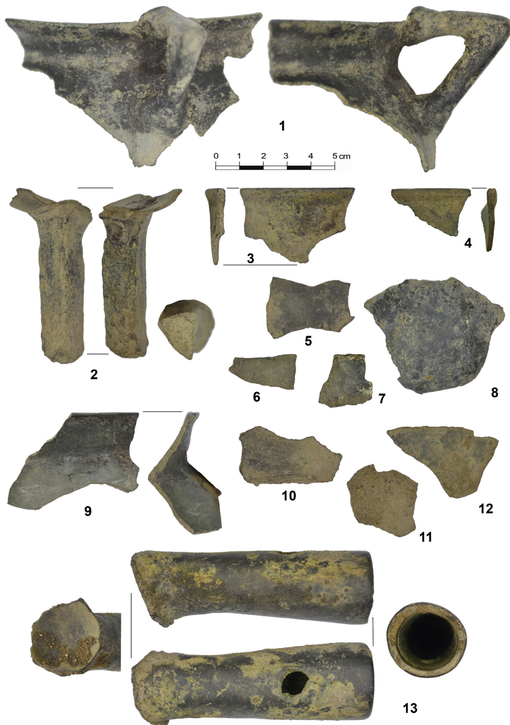
Fig. 3. Mierzyn, fragments of copper alloy vessels: 1 – inv. no. 08/28/08; 2 – inv. no. 15/07/21; 3 – inv. no. 05/13/07; 4 – inv. no. Mr 45/2021; 5 – inv. no. 21/05/06; 6 – inv. no. 12/13/07; 7 – inv. no. 11/28/08; 8 – inv. no. 21/05/06; 9 – inv. no. 08/21/07; 10 – inv. no. 08/21/07; 11 – inv. no. 30/13/07; 12 – inv. no. 06/26/06; 13 – inv. no. 01/21/07.

of the vessel and protruding slightly above its edge (Fig. 3:1). According to H. Drescher's classification, it can be described as variant 4. 10 The preserved fragment allows for a reconstructed stroke diameter of this graphene to be about 120 mm, and the maximum abdominal distension can be reconstructed to at least 148 mm. Based on the preserved fragment, the diameter of the rim of this Grapen can be reconstructed as approximately 120 mm and