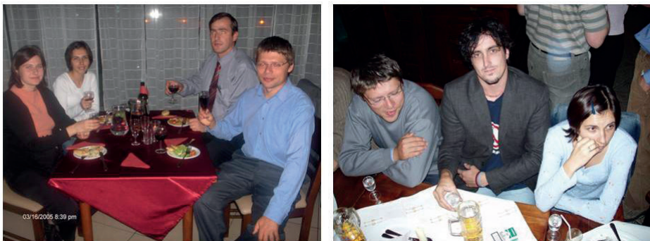
Figure 1. Warsaw Regional Forum Core and peripheral regions in Central and Eastern Europe, 5-8 October 2005

During the Warsaw Regional Forum conferences, field trips have always been an essential part. During these field trips, the participants had the chance were to interact with local stakeholders and representatives of various institutions with an important role in local development where they had the opportunity to challenge their theoretical knowledge with the practicalities of regional and local development. On the occasion of each Warsaw Regional Forum, a new route of the trip was meticulously prepared in such a way to include interesting tourist and scientific sites (WRF, 2021).