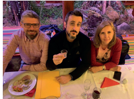
Figure 3. Warsaw Regional Forum Towards spatial justice-territorial development or marginalization , 16-18 October 2019