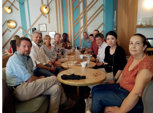
Figure 12. IGU Centennial Congress, Paris, July 18-22, 2022