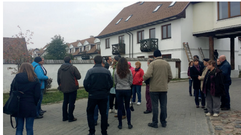
Figure 2. Warsaw Regional Forum Space of flows , 18-20 October 2017