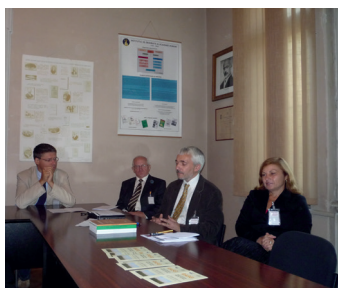
Figure 5. Scientific seminar Central Europe – Socio-Economic Disparities, Rural and Regional Development , Bucharest, September 2008

Under the joint agreement, a scientific seminar Central Europe – Socio-Economic Disparities, Rural and Regional Development was organized in Bucharest on September 18, 2008 (Fig. 5). The main themes were related to accessibility as the key problem of regional development in Central and Eastern Europe, economically successful areas in Poland, development of non-agricultural functions on rural areas during transformation period, inter-communal cooperation and regional development in Romania, Sustainable development for the Danube Delta rural communities, spatial differentiation and changes of agriculture in Poland, types of rural landscapes in Romanian Subcarpathians, intraregional peripheries of socio-economic development, characteristics of tourism demand within sustainable tourism perspective, foreign investments in industry and regional development. A field trip was organized in Danube Delta and Black Sea seaside area in Tulcea and Constanța counties (Fig. 6).