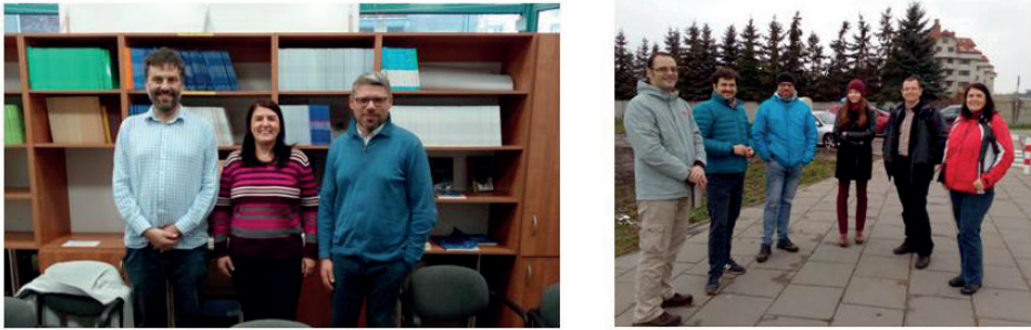
Figure 8. Inter-academic exchange, November 2018

In the framework of the Joint Research Projects various interesting field trips were held in Romania and Poland and had in view different scientific issues: social-economic transformations in the Romanian and Polish suburban areas, natural hazards in the Romanian and Polish Carpathian Mountains, regional differences in the socio-economic development of rural areas, assessment of the rural-urban continuum, internal peripheries in Poland and Romania (Fig. 8).