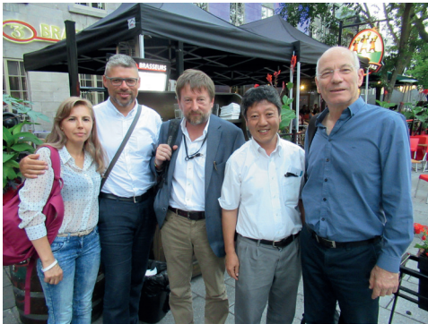
Figure 11. IGU Regional Conference, Quebec, August 6-10, 2018