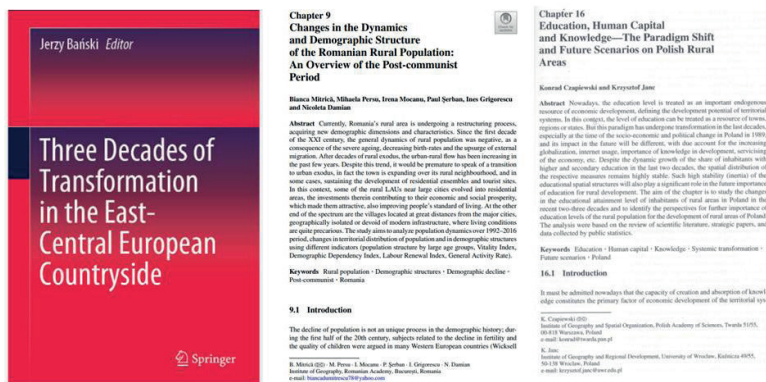
Figure 7. J. Bański (Ed.) (2019), Three Decades of Transformation in the East-Central European Countryside

Two chapters related to the thematic of the bilateral project on Internal peripheries in Polish and Romanian regions – role of endogenous and exogenous factors in their development processes were published in the book edited by Prof. Jerzy Bański Three Decades of Transformation in the East-Central European Countryside published in 2019 (Czapiewski & Janc, 2019; Mitrică et al., 2019) (Fig. 7).