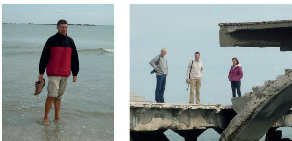
Figure 6. Field trip during the Scientific seminar Central Europe – Socio-Economic Disparities, Rural and Regional Development , Tulcea and Constanța counties, September 2008