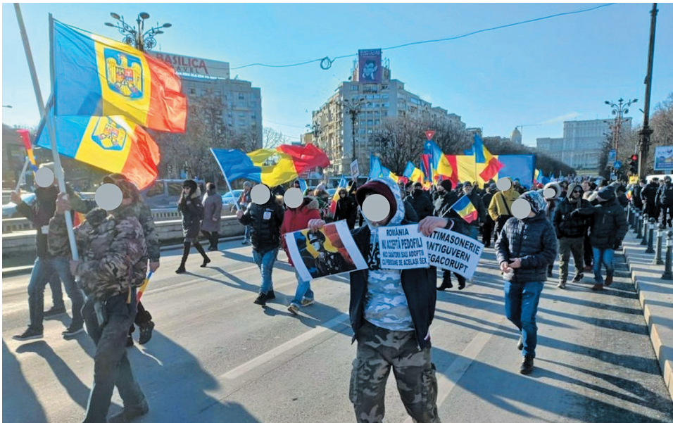
Picture 3. The march of AUR's supporters in December 2021. The supporters display the image of the second World War Marshall Ion Antonescu (a contested figure in Romania) alongside messages against paedophilia, masonry, corrupt government, and same sex marriages.

On 21 st December 2021, 1,500 supporters of AUR and other far-right groups marched across Calea Victoriei and stormed the gates of the parliament building, vandalising several cars belonging to foreign embassies. AUR sympathizers first jumped over parliament's perimeter wall and then pushed the security personnel protecting the building inside. During this violent rally, the redesigned flag and pro-freedom slogan were observed as the most striking visual symbols of the ceremonial revolution. AUR's storming of the parliament seems to parallel the modus operandi of the January 6 th Insurrection in the USA. In early 2022, AUR tried unsuccessfully, to replicate the Canadian truckers protests and block transportation in Bucharest.