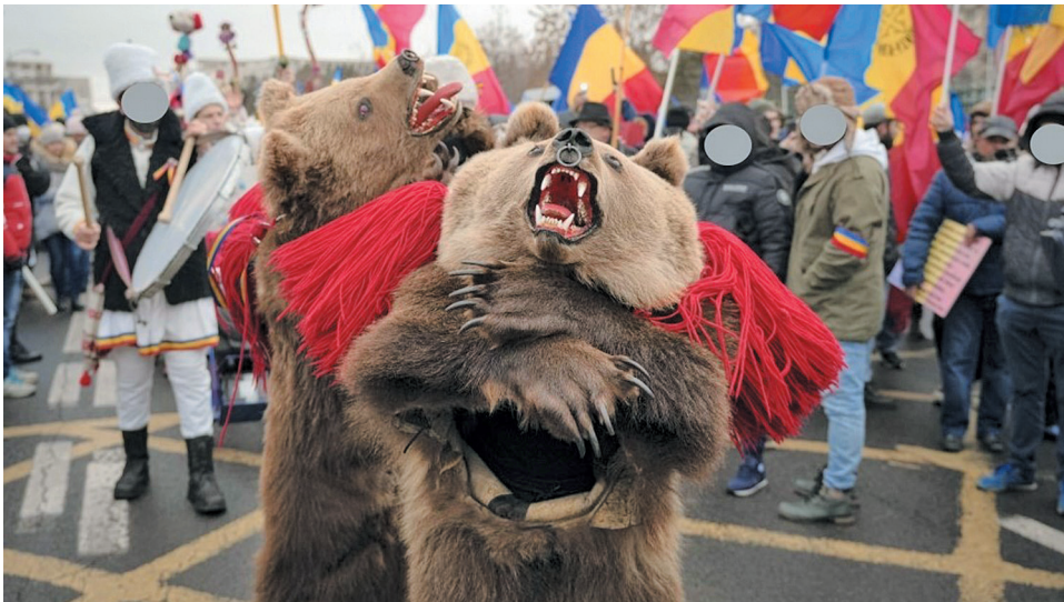
Picture 2. Traditional bear costume brought by AUR's supporters from the northern Romania at the October rallies.