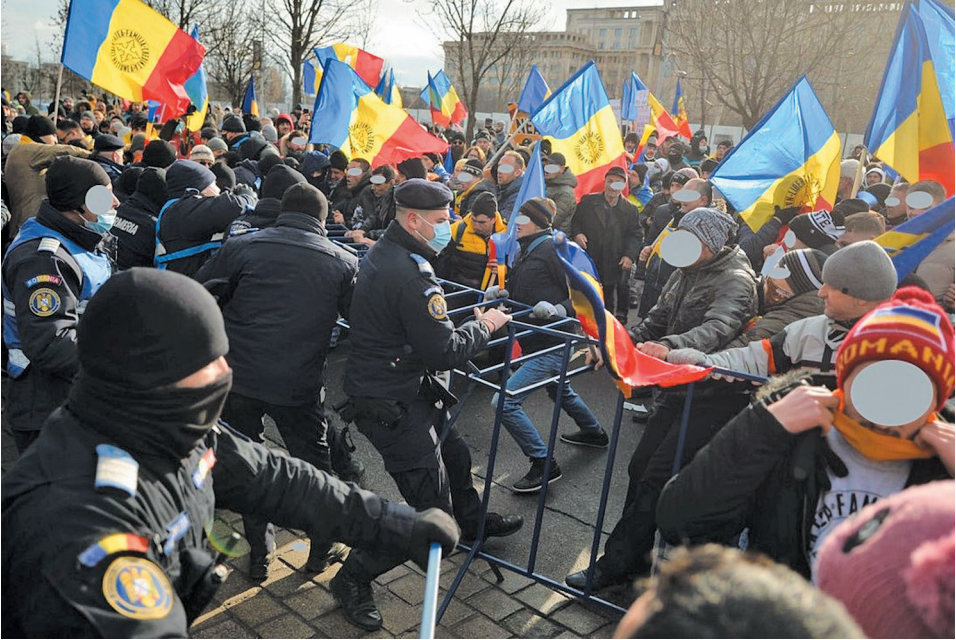
Picture 4. AUR's supporters are storming the gate of the parliament and fight the gendarmes assigned to protect the institution.

Many of these events bear a striking similarity. In all of them, people attempt to challenge the rules of the democratic process, with which they disagree. Further analysis has revealed that most ultra-conservative groups which supported AUR in 2021 joined the storming of parliament. The Orthodox Brotherhood and the New Right members were the most prominent among them. The call for action was justified by fears that the proceedings from parliament would affect people's freedom and deprive them of their constitutional rights; therefore, it was their duty to stop the vote. As argued by Mudde (2019), in its conceptualization of far-right ideology, AUR's sympathizers confirmed the party's strong ideological shift to the fringes of the right. They engaged in violence against government institutions to draw the media's attention to their ideas.