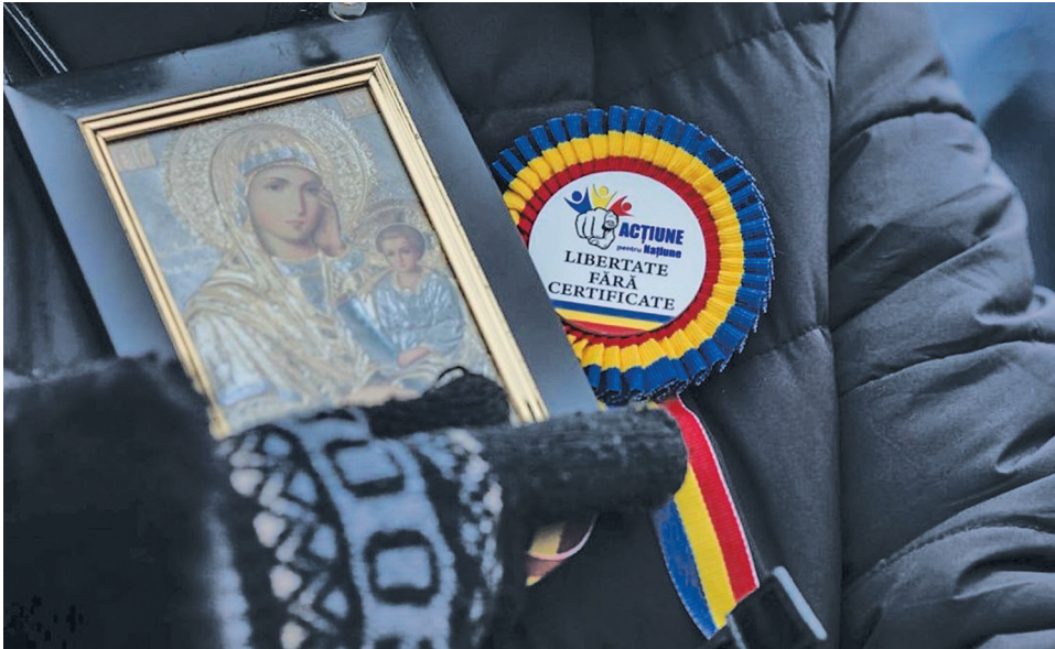
Picture 1. Iconography used by AUR's supporters at the October and November rallies. The icon represents Virgin Mary and baby Jesus, a beloved and sacred image in the Romanian consciousness. The second is a ribbon whose contours showcase the Romanian flag. It was handed by AUR and the NGO "Action for the Nation" to the people participating at the rallies.