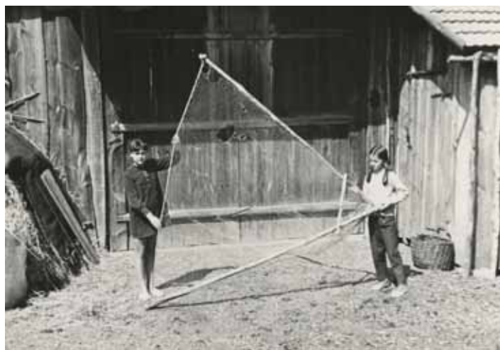
Photograph No. 14: Photograph PAE/F/31.26.XV/1292.71.5/01 – Kazimierz (near Puławy) – fishing nets, source: http://www.pae.us.edu.pl/items/show/11449 , access: 10.07.2020.