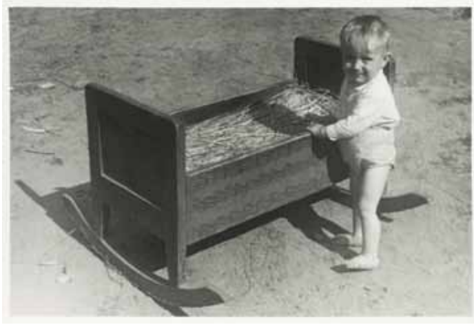
Photograph No. 8: Photograph PAE/F/33.25.VIII/832.65.25/01 – Paszki Małe (near Radzyń Podlaski) – a ground cradle, source: http://www.pae.us.edu.pl/items/show/12772 , access: 10.07.2020.

the cradle fits into the thematic area of material culture, related to household accessories. A child in the photograph taken in 1966 in Książnica Śląska (near Dzierżonów) not only demonstrates “its own” cradle, but indirectly shows its play-related use. Putting the closest objects into motion is one of the first games a child can play alone.