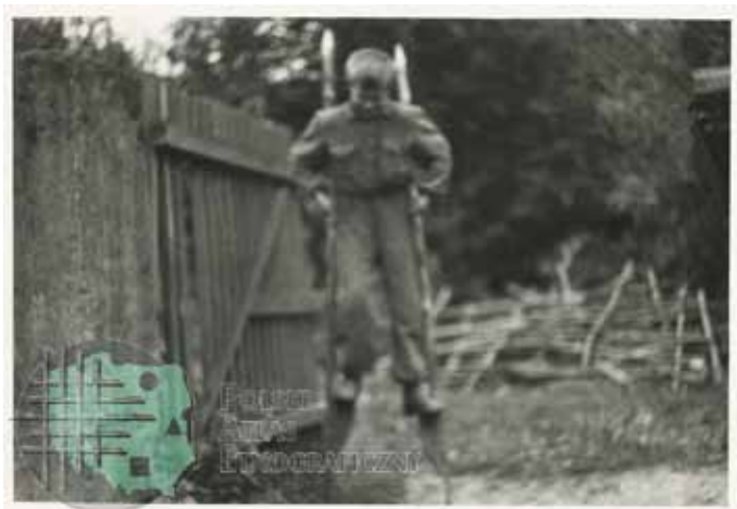
Photograph No. 17: Photograph PAE/F/28.14.XIII/344.61.9/01 – Grom (near Szczytno) – stilts, source: http://www.pae.us.edu.pl/items/show/9608 , access: 10.07.2020.

successfully shows the ludic nature of stilts was discovered. The photo was taken in 1961 in the town of Grom (near Szczytno). It is barely noticeable that a 10–12 year old boy is smiling while demonstrating the use of stilts ( chodzydła ) which shows that this rural tool was used as a source of entertainment for children. This becomes quite apparent when the photo of the boy is compared with the photo in which an older man demonstrates the stilts (photographs No. 17 and 18).