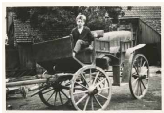
Photograph No. 15: Photograph PAE/F/7.23.VIII/457.61.11/01 – Kopce / Koperno (near Gubin) – a four-wheel open cart, source: http://www.pae.us.edu.pl/items/show/553 , access: 10.07.2020.

The PAE photos from the “Transportation and communication” section provide information not only about the playtime use of the aforementioned sleds and carts, or a children’s game, particularly enjoyed by older children, of pretending to be a coachman. The photos also document skates (14 photographs), wooden skis (3 photographs), and stilts (4 photographs). Children used the latter for fun. The PAE archives contain no photos of children using skates or skis. However, one photograph that