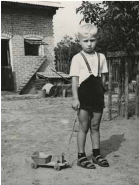
Photograph No. 1: Photograph PAE/ F/32.31.X/1215.69.33/01 – Jastkowice (near Tarnobrzeg) – children’s clothes, source: http://www.pae.us.edu.pl/items/show/12159 , access: 10.07.2020.

Working with archival iconographic material always involves methodological and interpretational difficulties. In the case of the digitalised PAE collection, available descriptions are often insufficient 10 . Doubts arise whether the way of interpreting the photos is correct and exhaustive 11 . Since the Digital Archives of the PAE enable quick access to over twelve thousand photos, the first step of every preliminary research is to choose the terms to be entered into the search engine on the archive website. Terminology connected with ludic issues was found useful when searching for photos depicting rural children’s toys and games in the PAE material, but, as numerous attempts have proved, it is not the only keyword that brings results worth discussing.