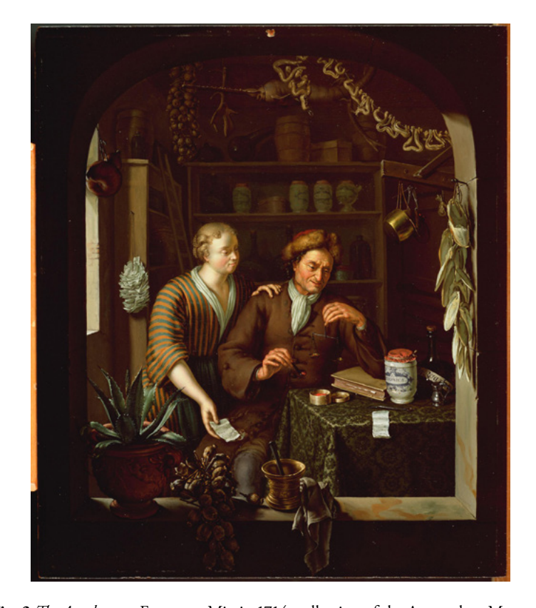
Fig. 3 The Apothecary , Frans van Mieris, 1714, collection of the Amsterdam Museum. In the foreground, a jar covered with parchment or leather.

time the palace changed its role. Although it remained in the hands of the Electors of Saxony, they used only a small part of the main building as an accommodation for their diplomatic and trade missions. The rest of the palace was divided into smaller sections, rented as offices and private apartments. It is possible that the pharmacy was still operating, but it is doubtful that new batches of storage vessels marked with the royal monogram were ordered for it (Borowska 2020: 114). In 1797, the palace was purchased by the King of Prussia, Frederick William II, and ceased to have a residential function. It appears that the pharmacy also ceased to exist at that time (if it had not been closed earlier, after the death of Augustus III).