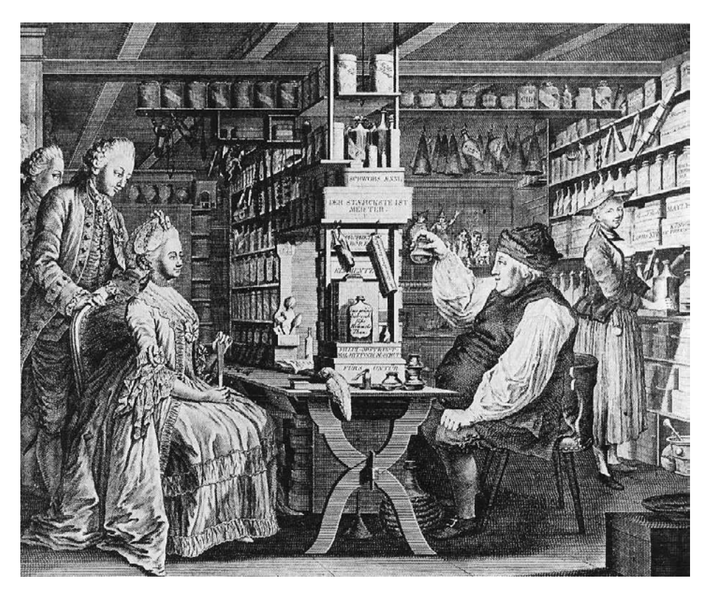
Fig. 4. Country Pharmacy, print showing French aristocratic customers at Michael Schüppach's pharmacy on the Dorfberg in Langnau in Switzerland. Author G. Locher (1774), engraver Bartholomäus Hübner (1775).

in Baden-Württemberg) or in an unspecified manufactory in Saxony.<sup>8</sup> Waldenburg produced large stoneware vessels for pharmaceutical and chemical companies (see, for example, Kowalczyk 2014: 31).