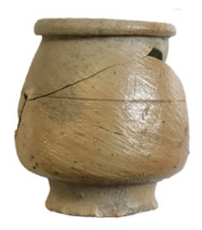
Fig. 6. Stoneware measuring vessel found on the site of the Saxon Palace in Warsaw.