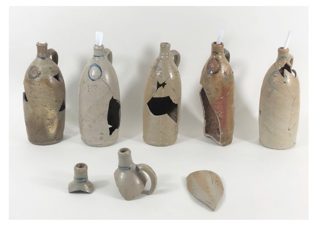
Fig. 7. Stoneware mineral water bottles found on the site of the Saxon Palace in Warsaw, height - 27-29 cm.

"Pharmacy to His Royal Majesty's Court" was the legacy of the court pharmacy of the Saxon Electors (Wenda 1917: 23).