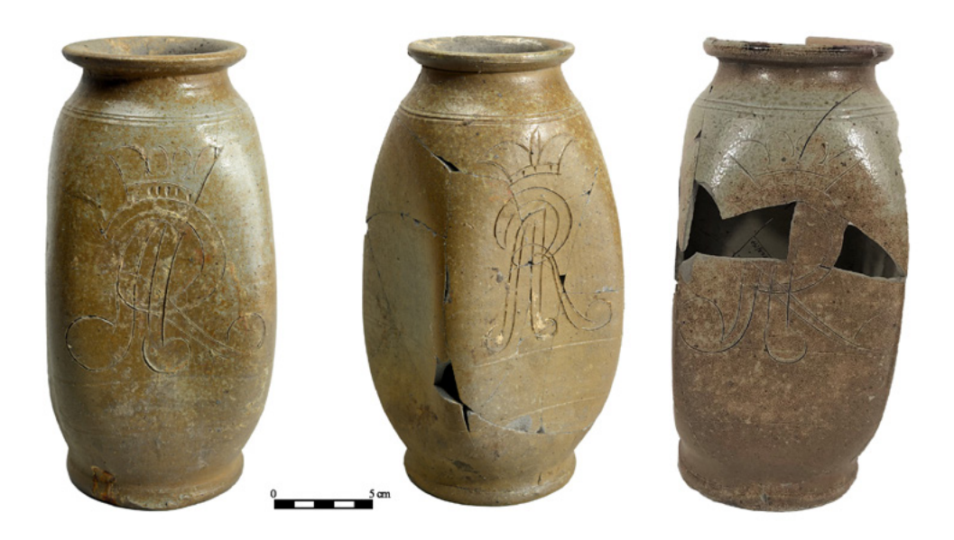
Fig. 1. Stoneware jars from the Saxon Palace in Warsaw.

The royal monogram of the Saxon rulers of Poland – crowned, intertwined letters "AR" – is incised on one side of the vessels (Fig. 1). The monogram on the jars is exactly