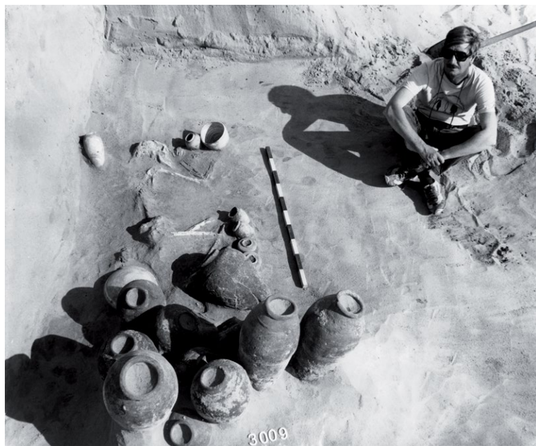
Fig. 7. Minshat Abu Omar, in the Eastern Delta, Egypt (1988). Michał Kobusiewicz during the excavation of a Predynastic grave.