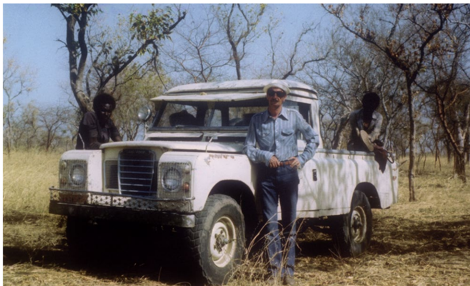
Fig. 5. SE Sudan near Abu Hugar. Survey along the banks of the Blue Nile.