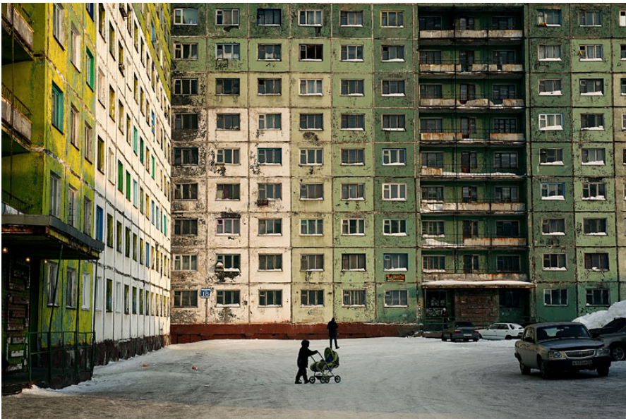
Figure. 2 In the city of Norilsk